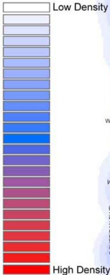
Density of Total Crime 2006