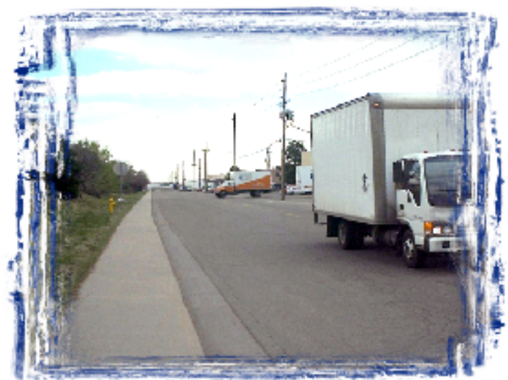
48th Avenue East of Colorado Boulevard