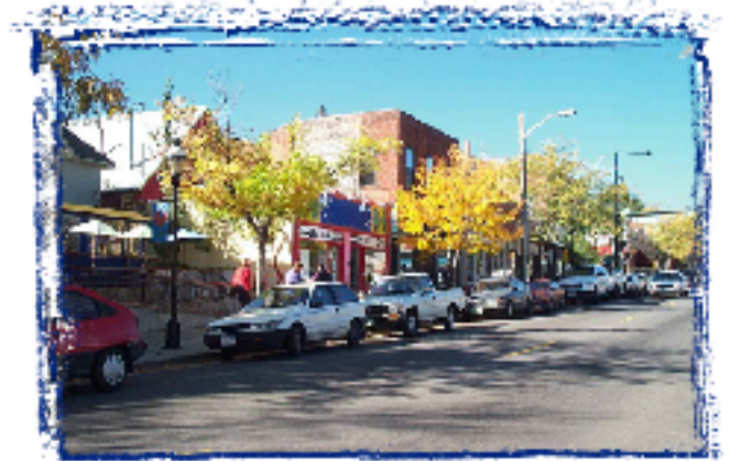
32nd Avenue at Lowell