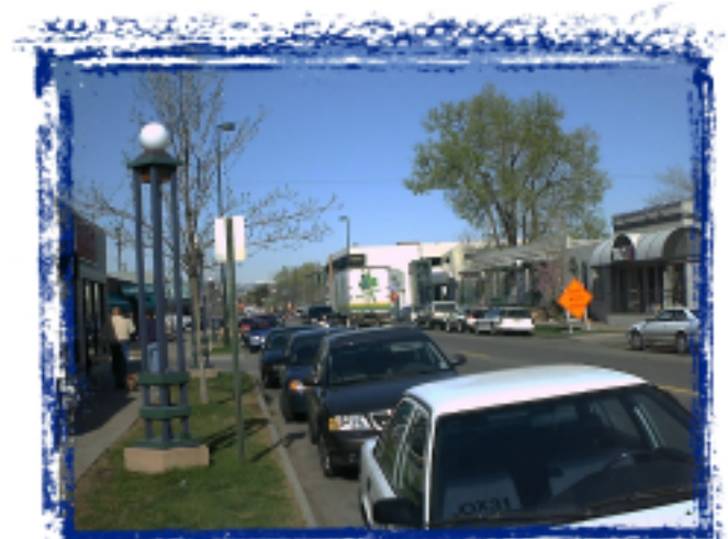
3rd Avenue in Cherry Creek North