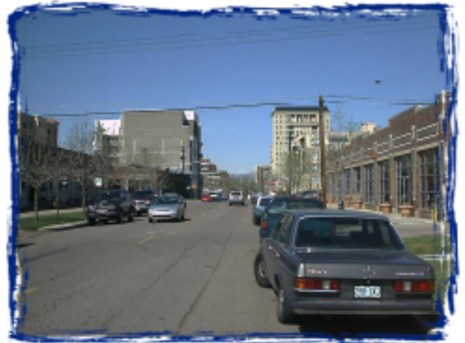
12th Avenue Near Bannock Street

Improvements such as landscaped medians and tree lawns are desirable to make Mixed-Use Streets more attractive for pedestrians and bicyclists. Mixed-Use Streets frequently provide on-street parking and wide sidewalks, depending on the type and intensity of adjacent commercial land uses.