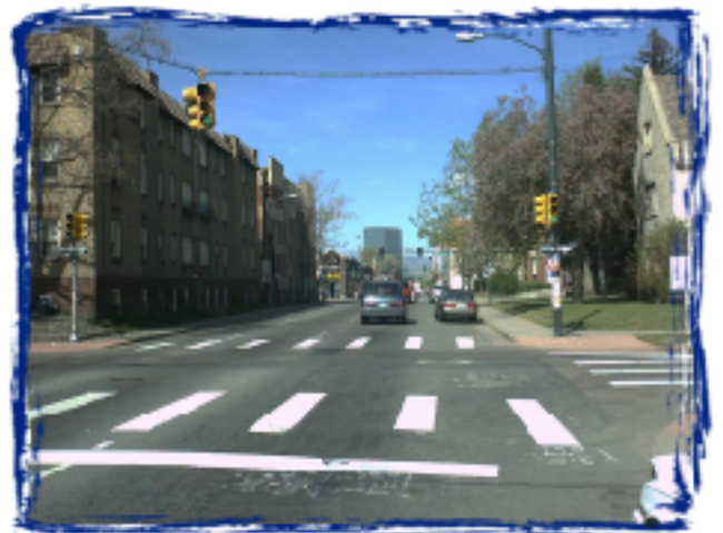
13th Avenue East of Broadway