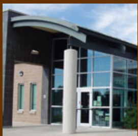
Cook Park Recreation Center