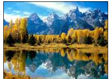
The rugged beauty of the Grand Tetons is reflected in Jackson Lake

For the full story, go to Charlie’s website at this link: http://www.denvergov.org/Default.aspx?alias=www.denvergov.org/CouncilDistrict6