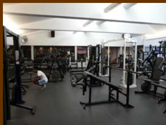
Weight Room at Washington Park Recreation Center