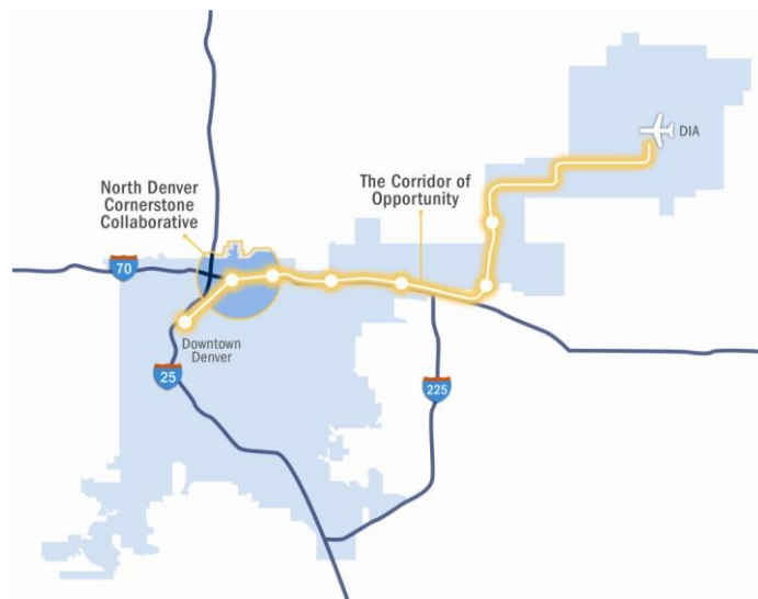
Corridor of Opportunity