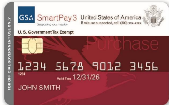
Purchase Card – Not Taxable