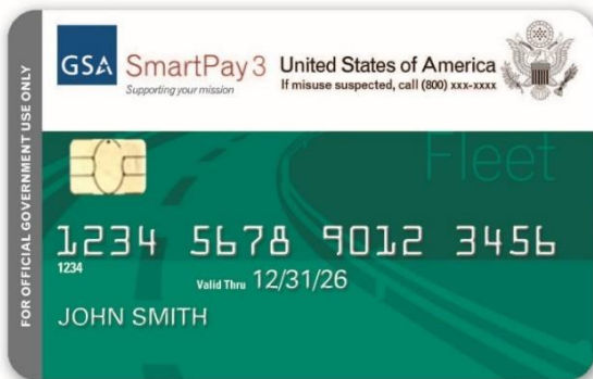
Fleet Card – Not Taxable