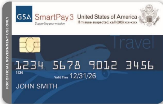
Travel Card – May or may not be taxable