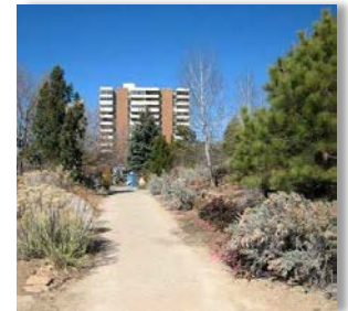
New greenhouse complex