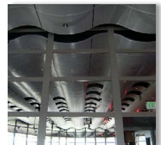
Updated ballroom finishes