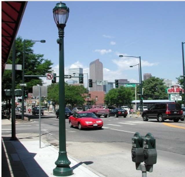
New lane striping