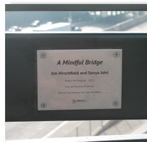
© Jim Hirschfield & Sonya Ishii, Oct. 2015