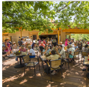
Outdoor pizza oven at The Hive