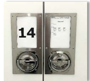
New exhibition space