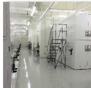
New exhibition space