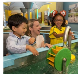
© Denver Museum of Nature & Science