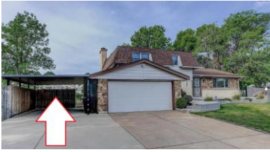
Exhibit D (Continued)

Construction would exist behind a gate out of sight.