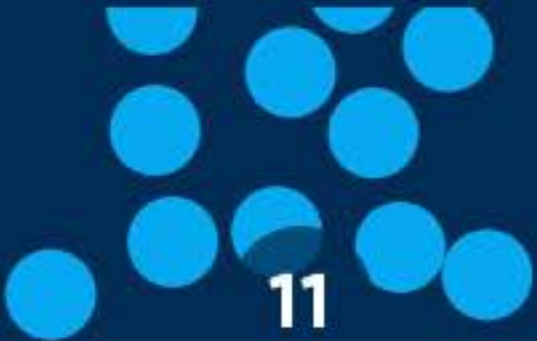
Places to live