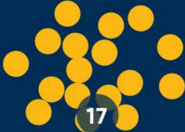
I shop and buy things