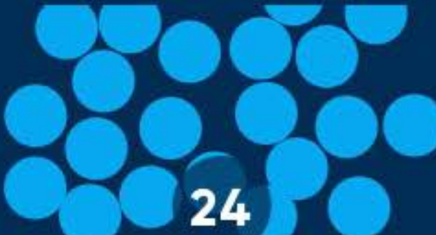
Places to shop, eat, and drink