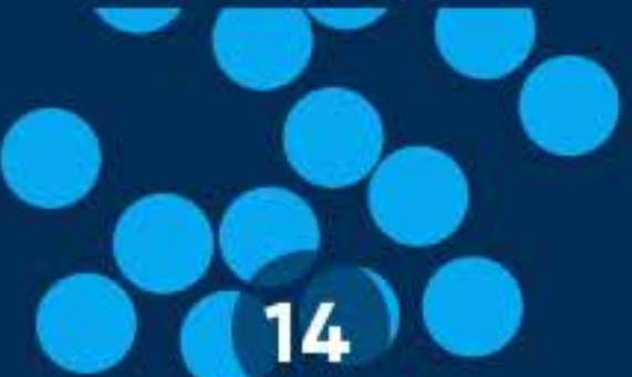
Places to work