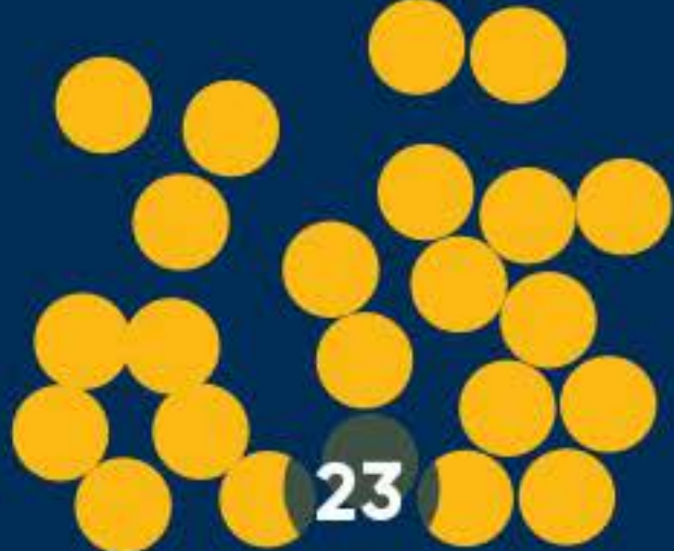
I eat and drink