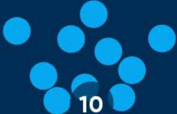
Places to park a car