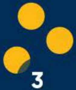
I work at a business