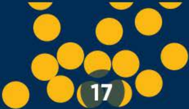
I live here