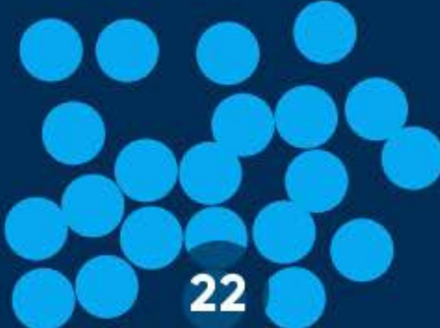
Places to sit and gather