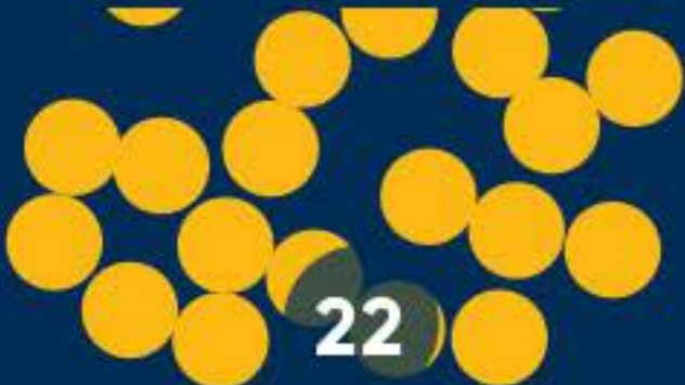
I own a property/residence