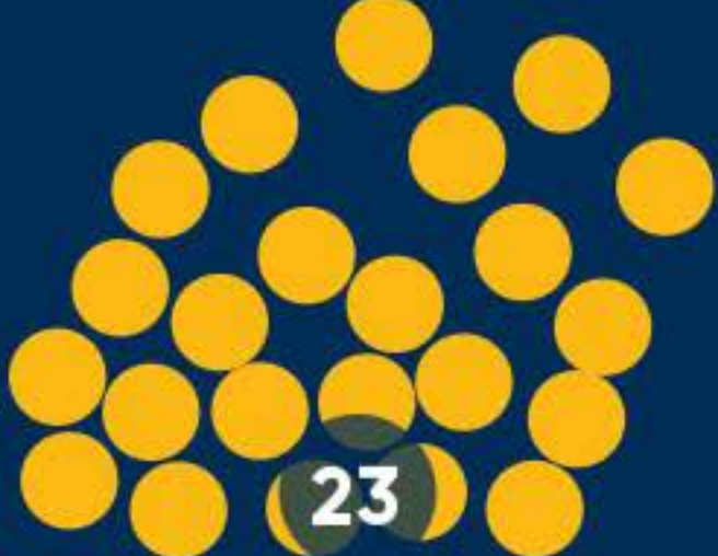
I visit the museums