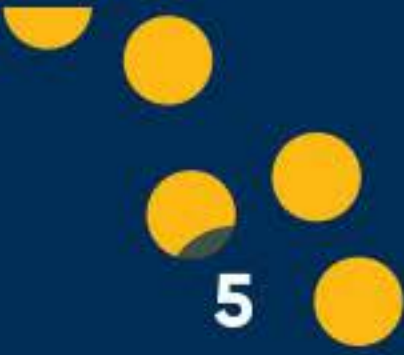
I own a business