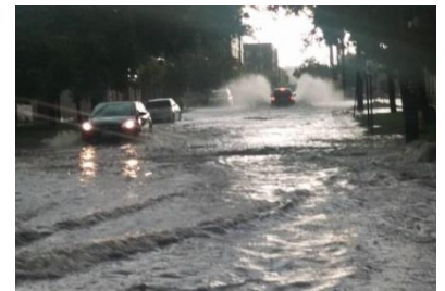
Photos from Spring 2015 flooding in North Denver depict a familiar concern for many.