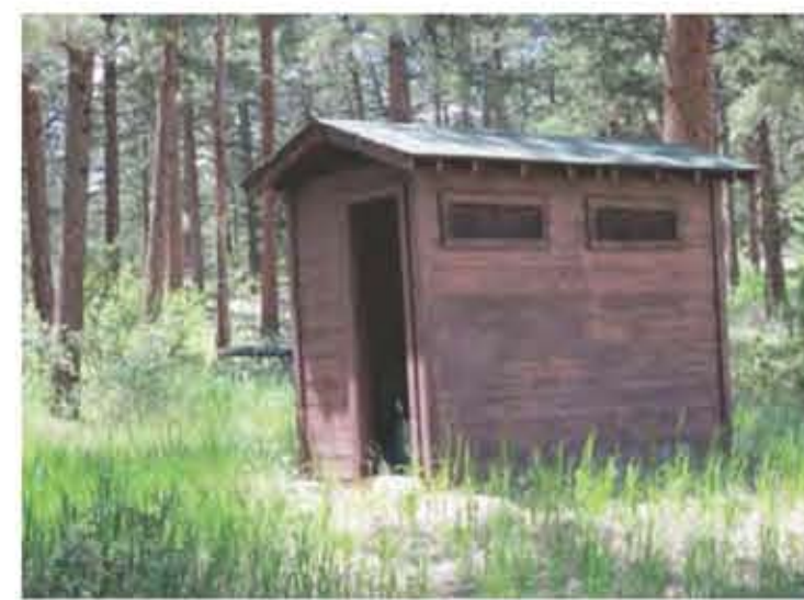
3. EXISTING PIT TOILET