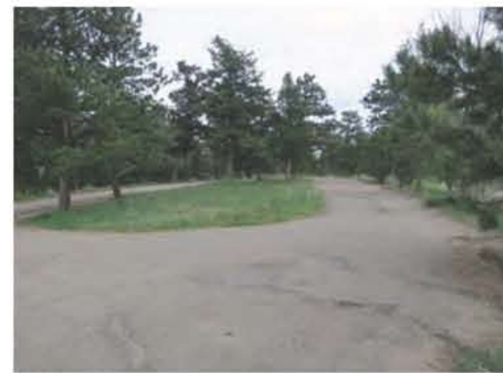
9. TURNAROUND AREA LOOKING EAST