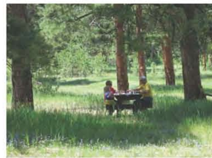
4. PEOPLE PICNICKING AT DAY USE AREA