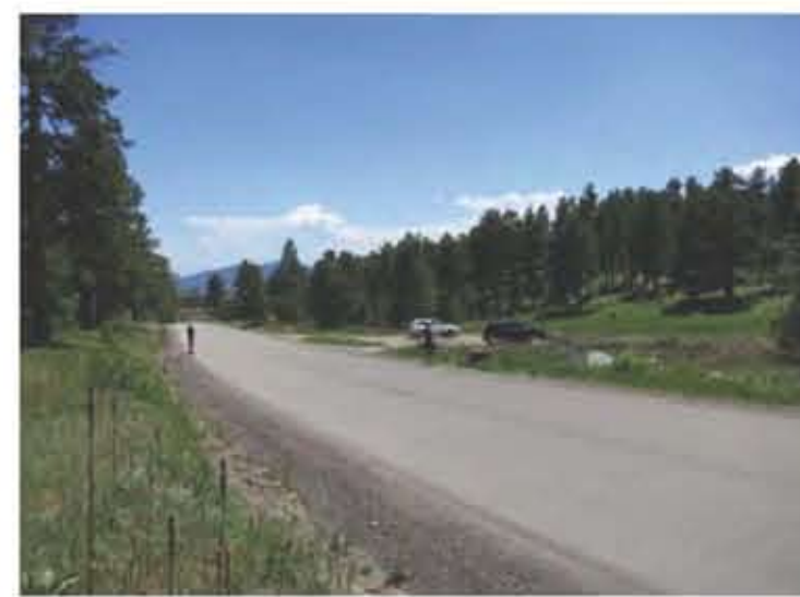
1. VIEW OF PARKING AREA LOOKING SOUTH