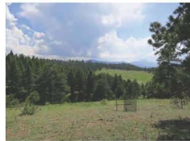
11. VIEW OF BISON PASTURE LOOKING WEST