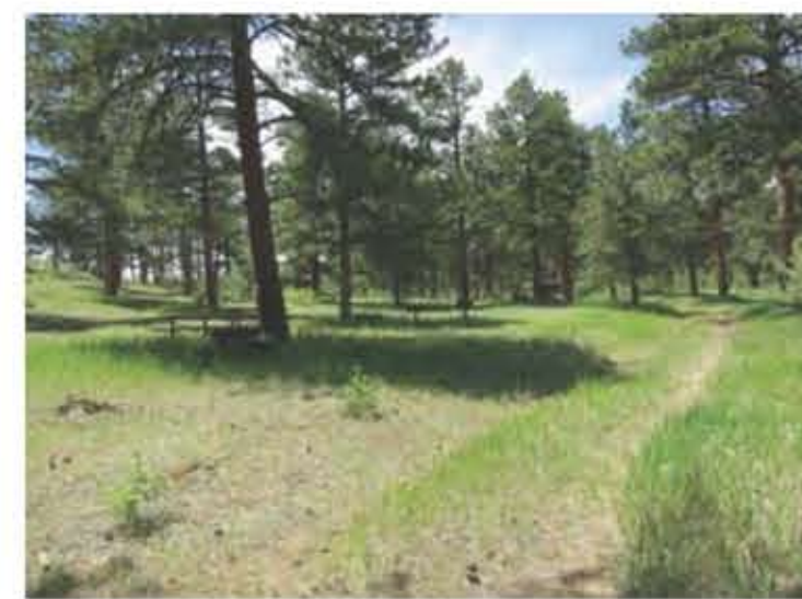
6. ACCESS ROAD LOOKING NORTH