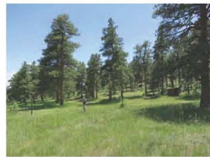
5. VIEW OF DAY USE AREA LOOKING SOUTH