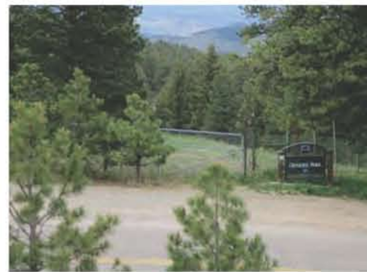
7. GENESSEE PARK SIGN ALONG GENESSEE MTN. ROAD