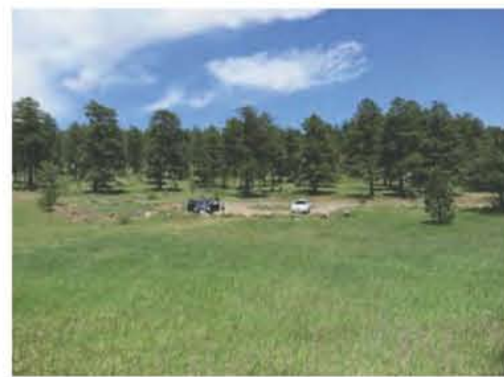
2. VIEW OF PARKING AREA LOOKING EAST