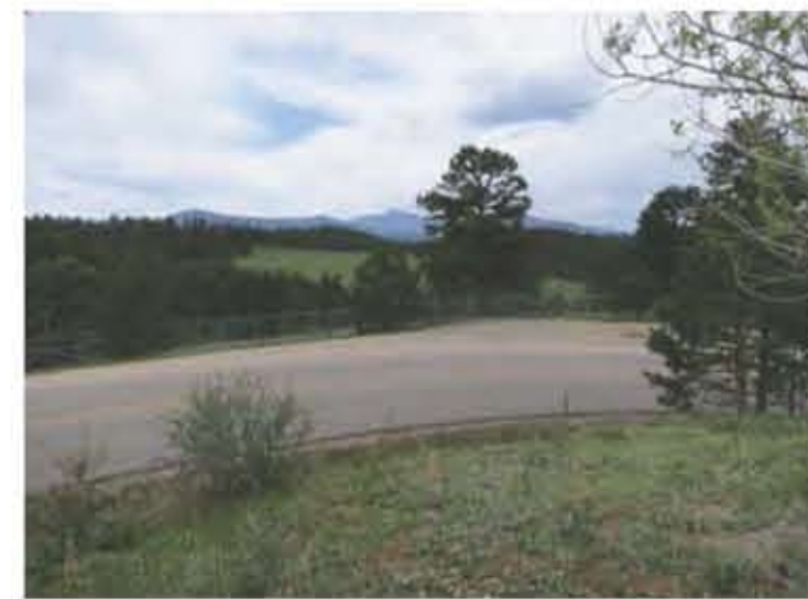
10. VIEW OF BISON PASTURE LOOKING WEST FROM PARKING AREA