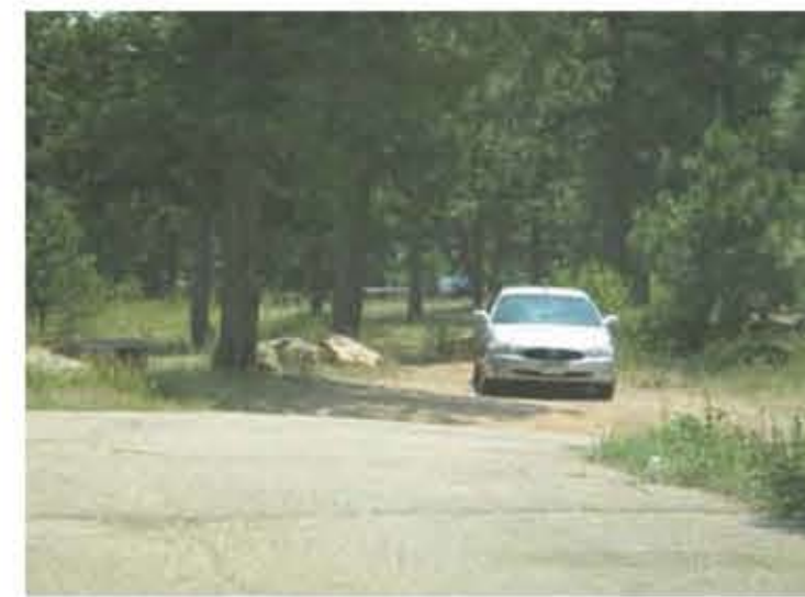
12. PARKING AREA AND PEOPLE PICNICKING