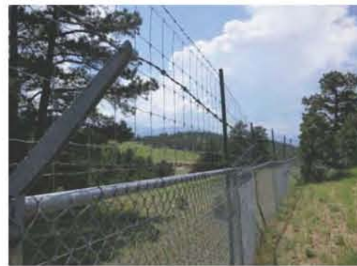
8. BISON FENCE LOOKING WEST TO TOILET