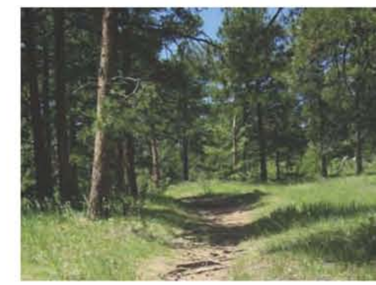
6. EROSION PROBLEMS ON EXISTING SOCIAL TRAIL