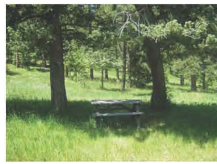
3. EXISTING PICNIC TABLE