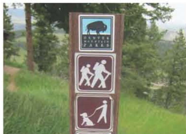
13. EXISTING TRAIL SIGNAGE