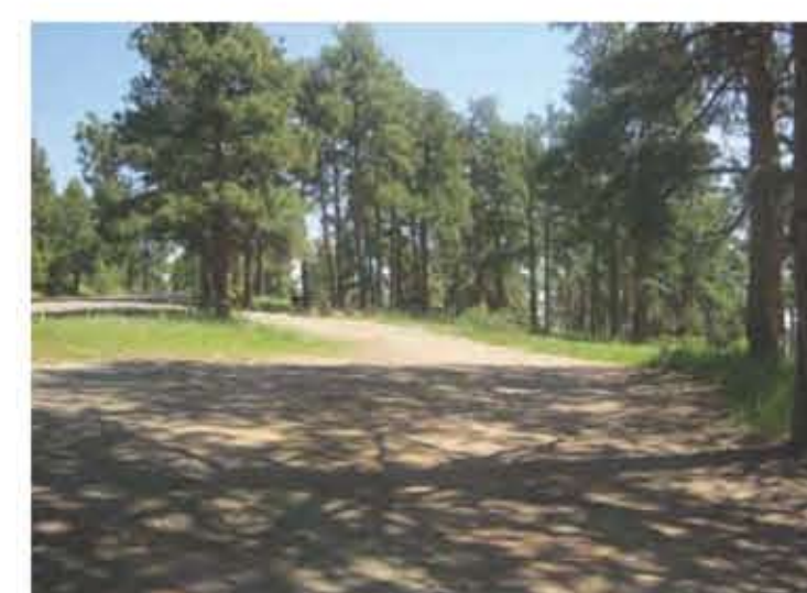
22. DAY USE AND PARKING AREA