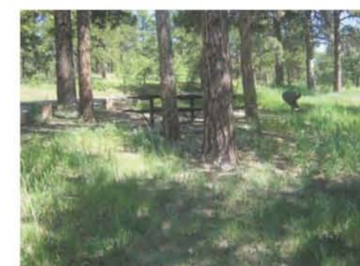
24. EXISTING DAY USE AREA