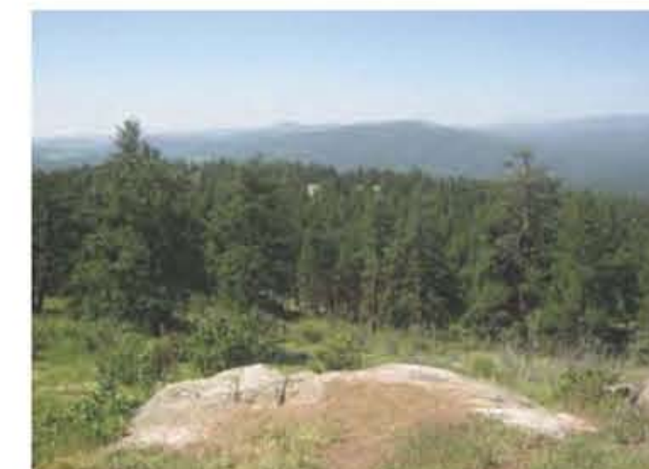
17. EXISTING UNDEVELOPED OVERLOOK LOOKING SOUTHWEST