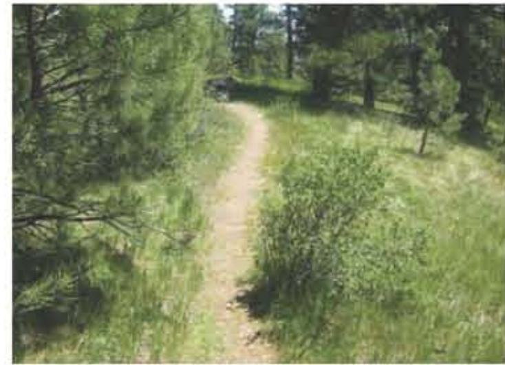
7. EXISTING SOCIAL TRAIL LOOKING NORTHEAST