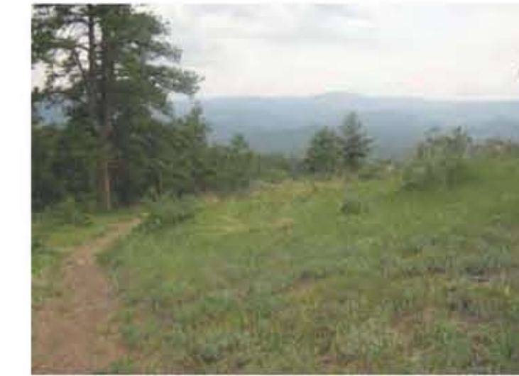
12. EXISTING TRAIL LOOKING SOUTHEAST