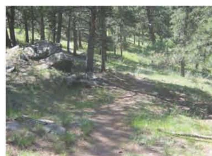
21. EXT. TRAIL LOOKING SE WITH GRILL ALONG TRAIL