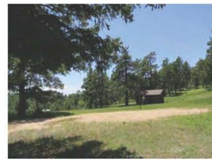
4. TRAIL CONNECTION TO DAY USE AREA