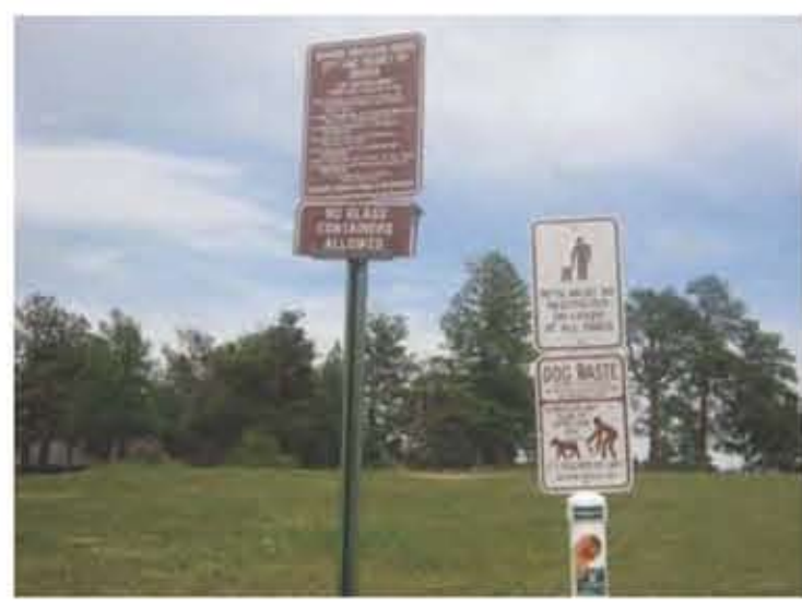
1. PARKING AREA LOOKING NORTH