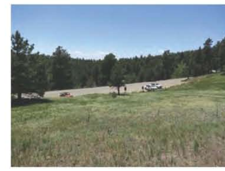
5. EXISTING PARKING AREA