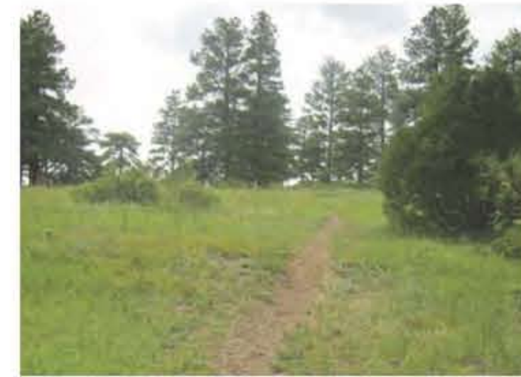
10. EXISTING TRAIL FROM FLAGPOLE, VIEW LOOKING NORTHWEST