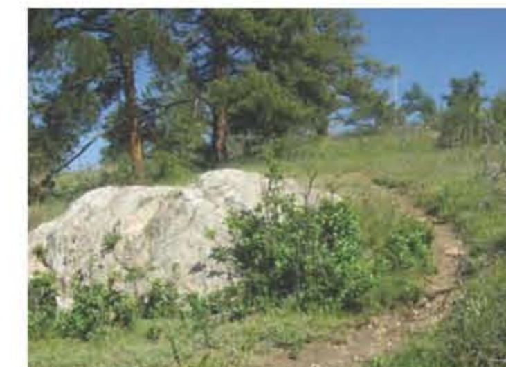
18. EXISTING UNDEVELOPED OVERLOOK LOOKING NORTH