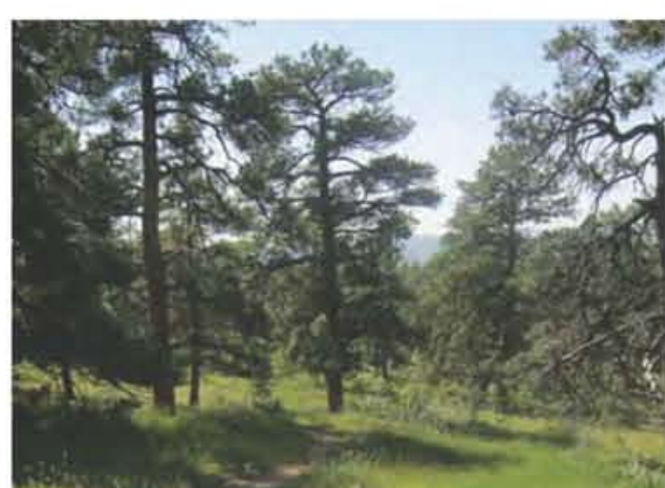
19. EXISTING TRAIL LOOKING SOUTHEAST