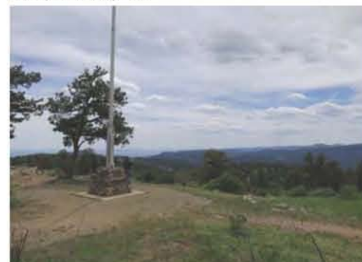
15. FLAGPOLE AREA