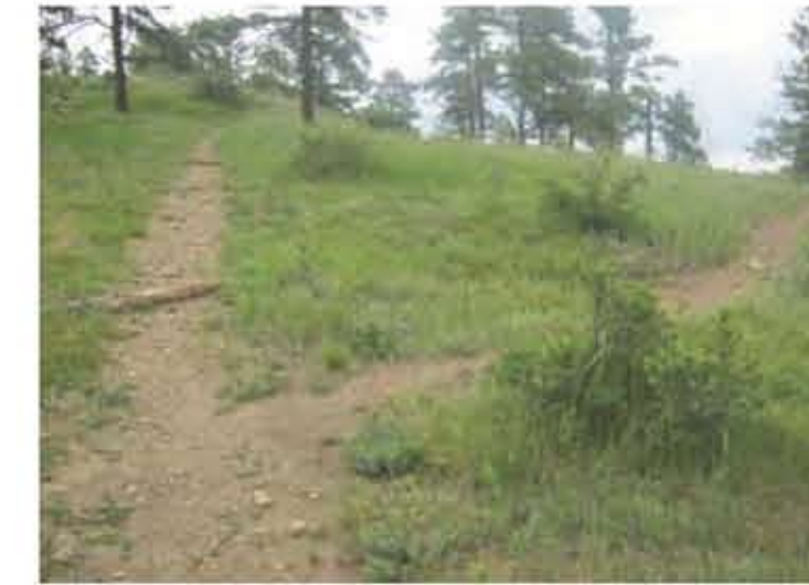
11. EXISTING TRAIL LOOKING NORTH