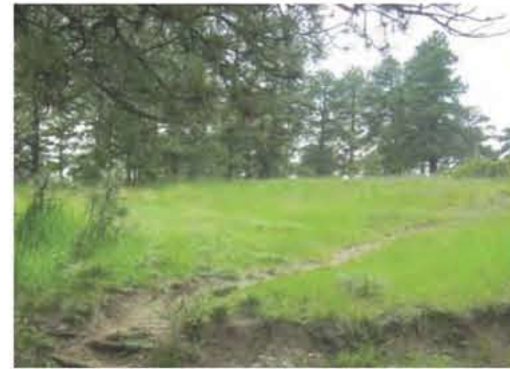
9. EXISTING TRAIL FROM FLAGPOLE, VIEW LOOKING NORTHWEST