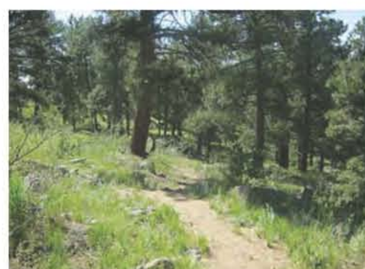
20. EXISTING TRAIL LOOKING SOUTHEAST