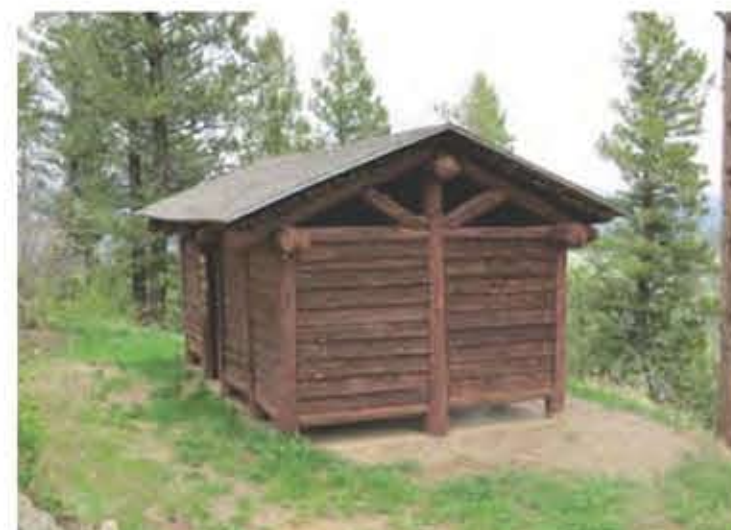
14. EXISTING PIT TOILET