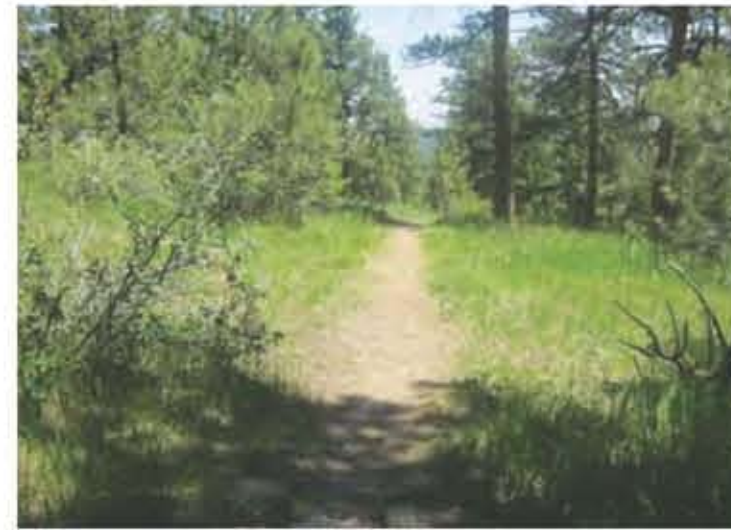
8. EXISTING SOCIAL TRAIL LOOKING NORTHEAST