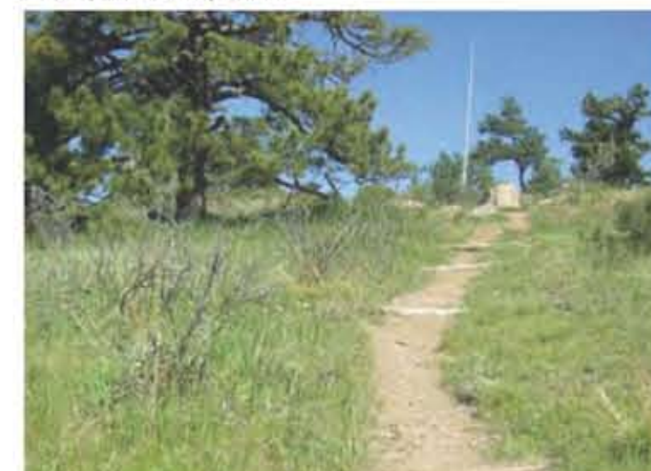
16. EXISTING NETWORK OF TRAILS AROUND FLAGPOLE AREA