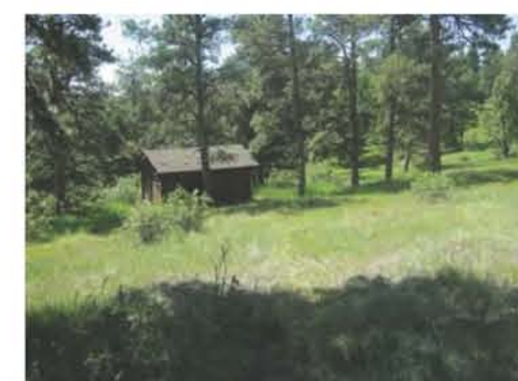
23. EXISTING PIT TOILET