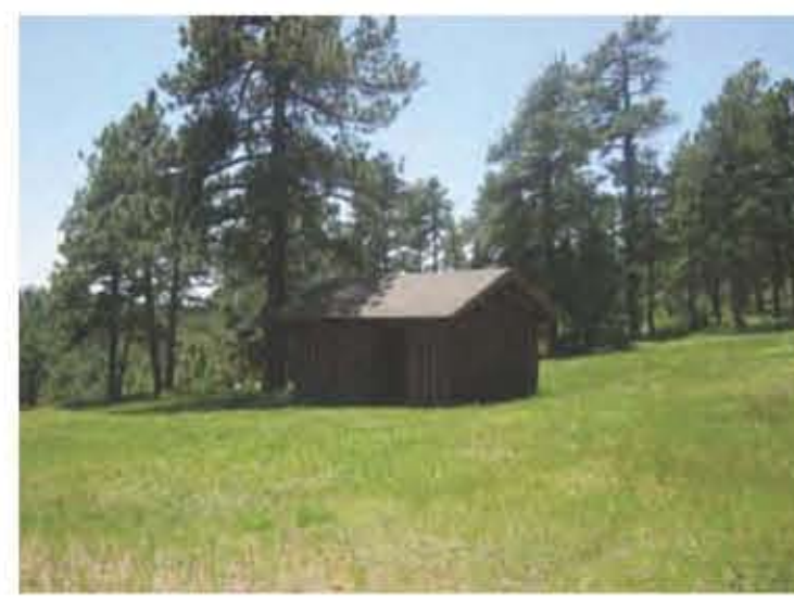
2. EXISTING PIT TOILET