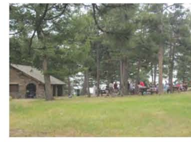
17. FAMILY REUNION AT GROUP USE SHELTER