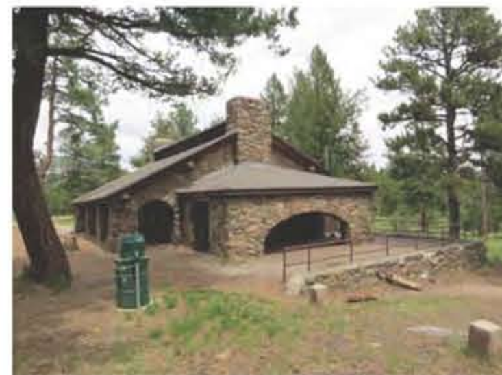
19. BACKSIDE OF SHELTER