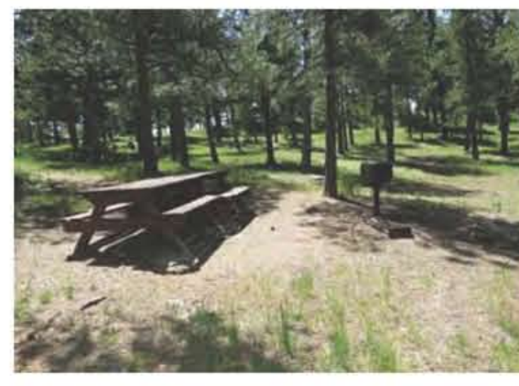
15. DAY USE AREA AMENITIES