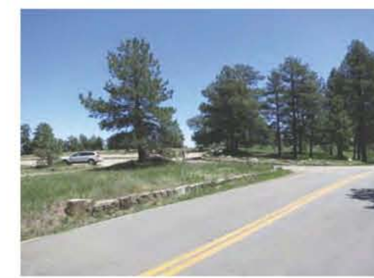
12. GENESSEE MTN. ROAD AND DAY USE PARKING AREA