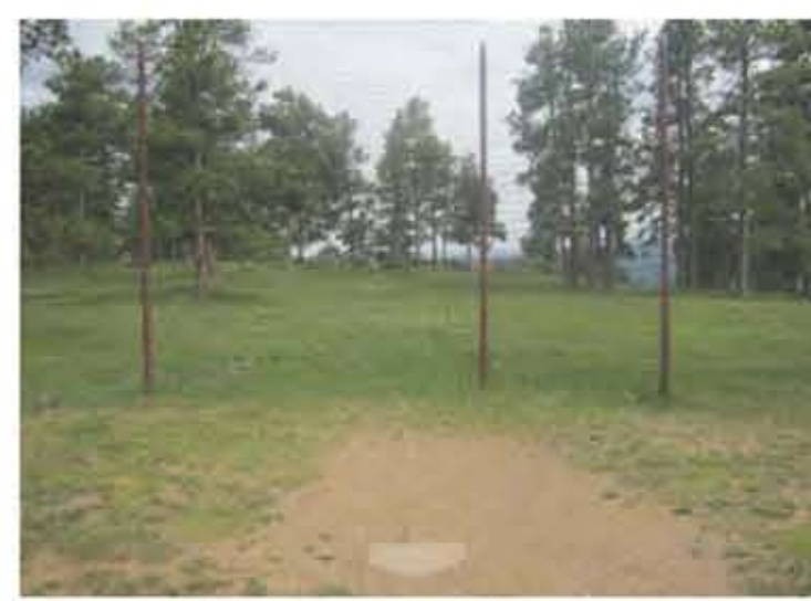
7. BACKSTOP IN OPEN FIELD