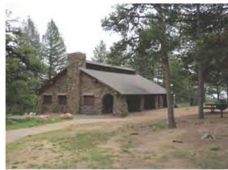
1. GROUP USE SHELTER