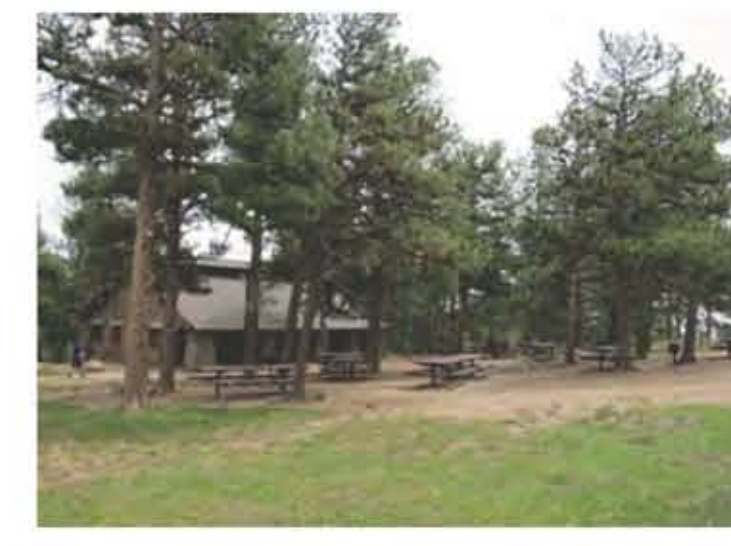
18. PICNIC TABLES AND GRILLS OUTSIDE SHELTER