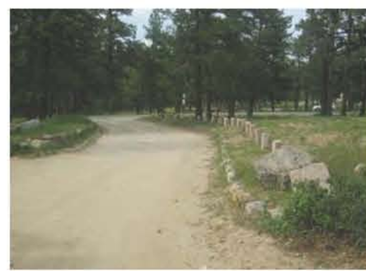
9. EXISTING PARKING LOT ROAD