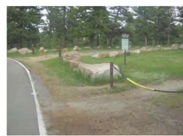
4. VEHICLE GATES ALONG GENESSEE MTN. ROAD