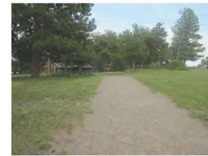
6. PATH FROM PARKING TO GROUP SHELTER