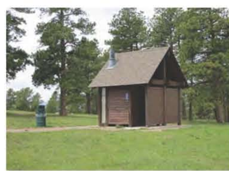
3. VAULT TOILET AT GROUP USE SHELTER