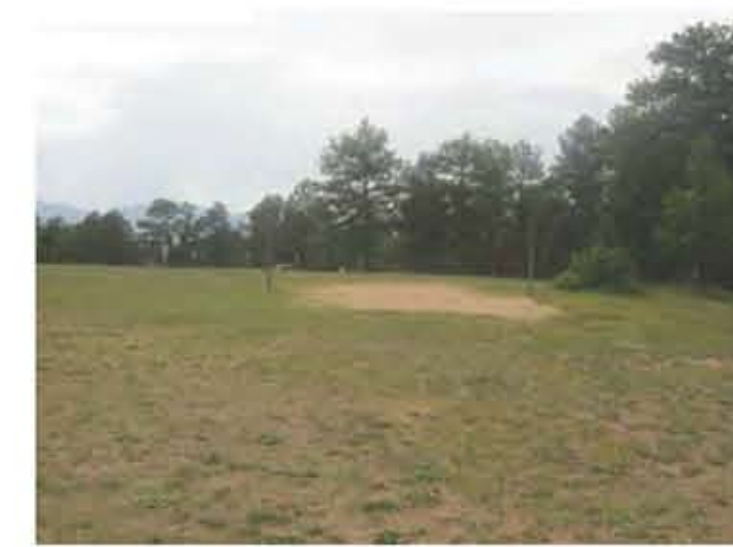
5. OPEN FIELD AT GROUP SHELTER, VIEW LOOKING WEST