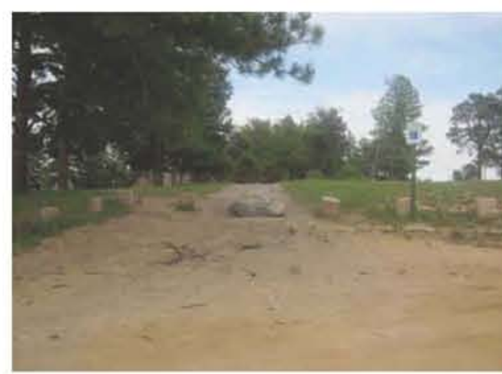
8. ADA PARKING AND PATH TO GROUP USE SHELTER