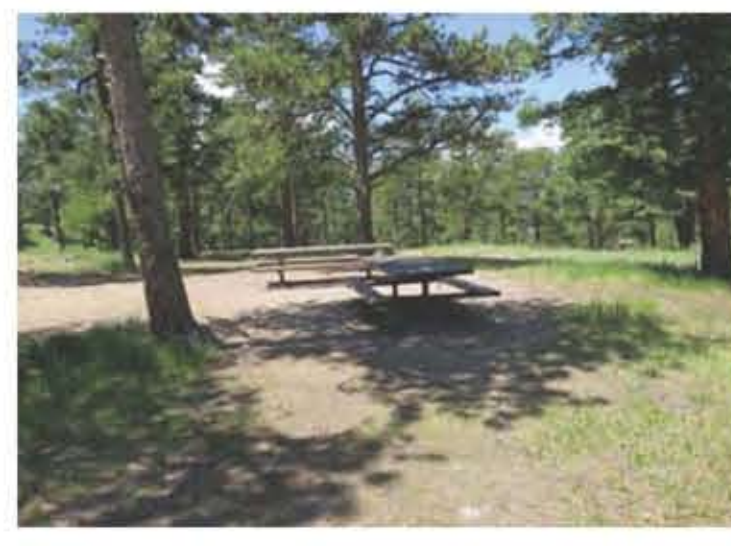
14. DAY USE AREA AMENITIES