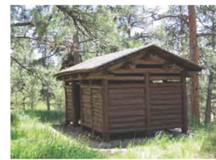
11. PIT TOILET