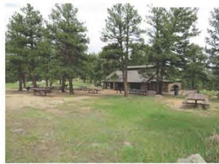
2. GROUP USE SHELTER AND DAY USE AREA