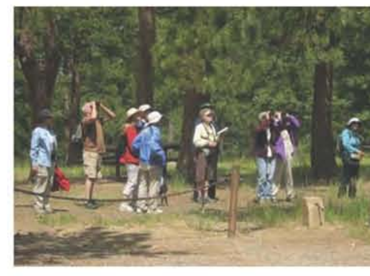
16. AUDUBON SOCIETY USING THE DAY USE AREA