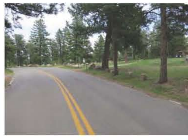
13. GENESSEE MTN. ROAD, LOOKING WEST