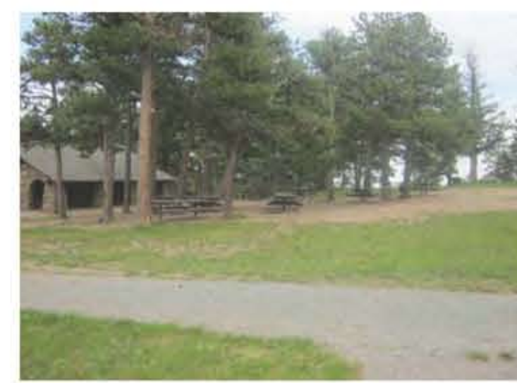
10. PATH TO GROUP USE SHELTER