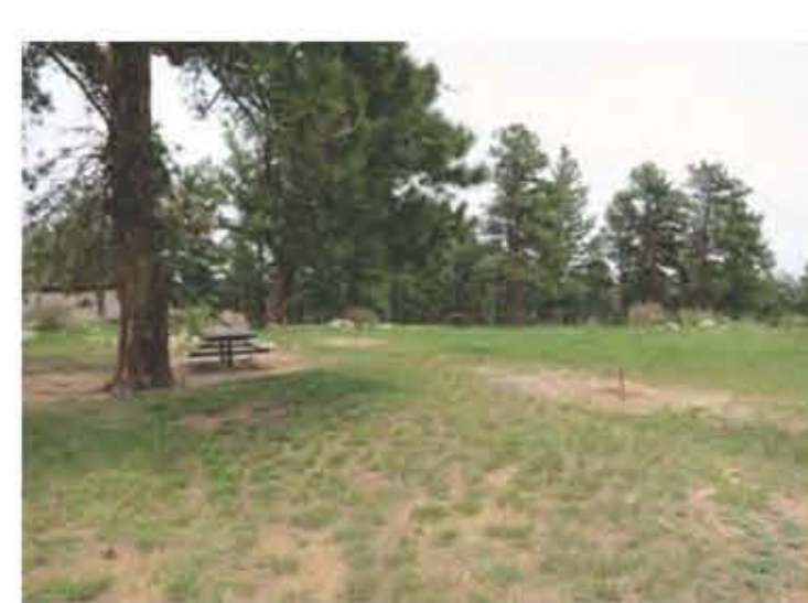
21. PICNIC TABLE AND HORSESHOE PIT