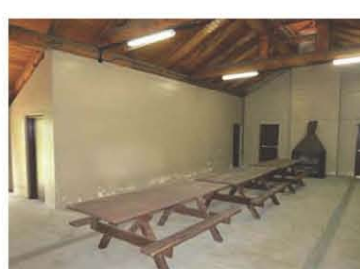
20. INSIDE OF GROUP SHELTER