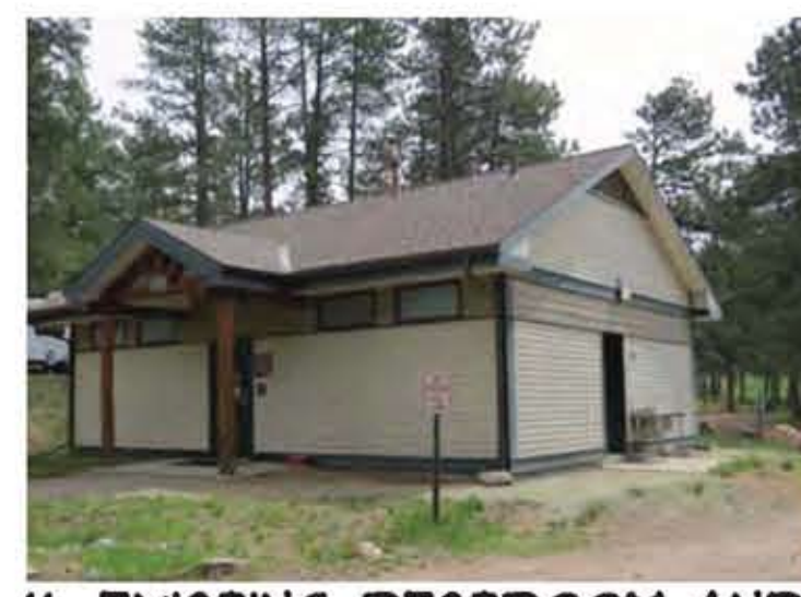
11. EXISTING RESTROOM AND SHOWER BUILDING