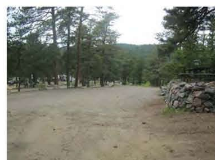
4. EXISTING PARKING AREA AT THE LODGE