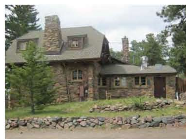
3. VIEW OF LODGE WEST SIDE