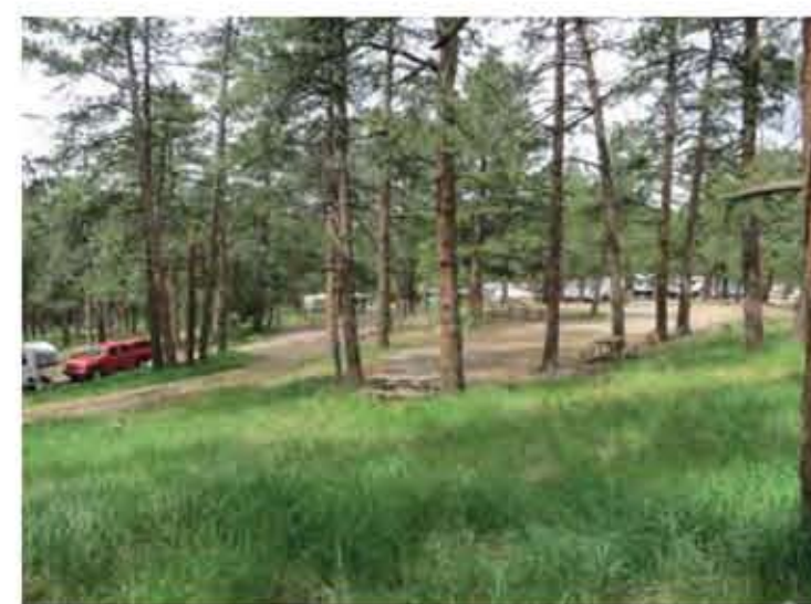
7. VIEW OF CAMPGROUND LOOKING SOUTHWEST