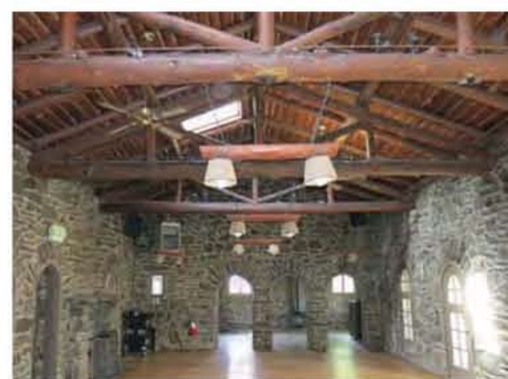
1. INTERIOR VIEW OF CHIEF HOSA LODGE