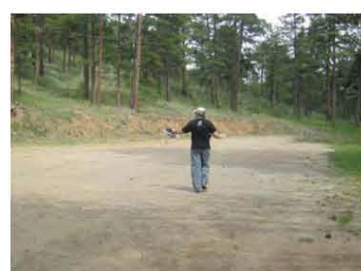
5. EXISTING PARKING AREA AT THE LODGE