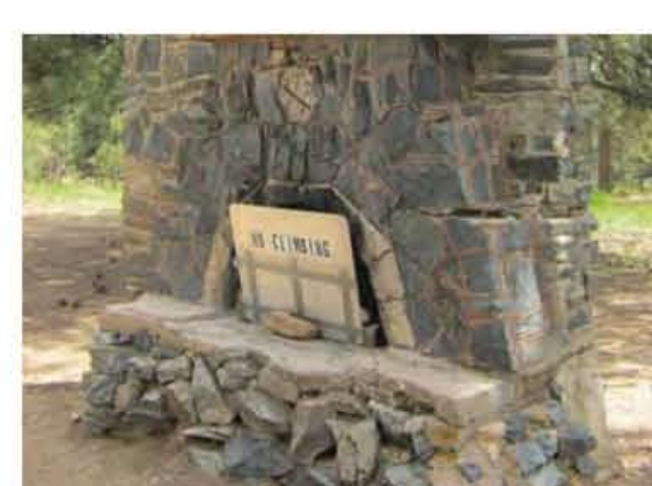
10. EXISTING CCC ERA FIREPLACE