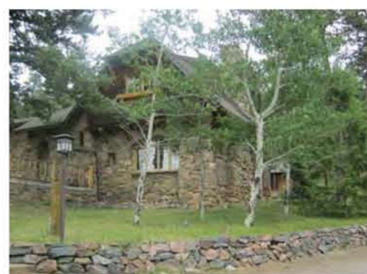
2. VIEW OF LODGE SOUTH SIDE