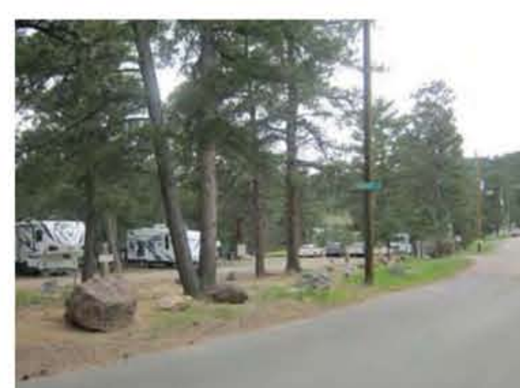
6. VIEW OF CAMPGROUND LOOKING SOUTHWEST