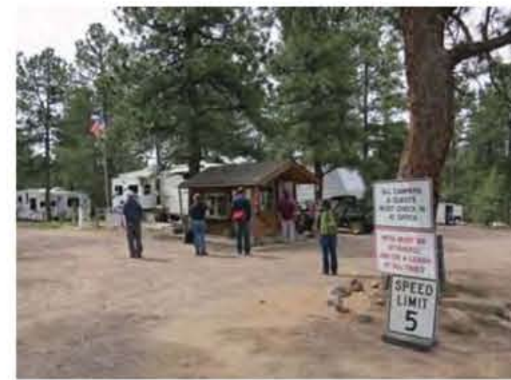
8. ENTRY STATION AT THE CAMPGROUND