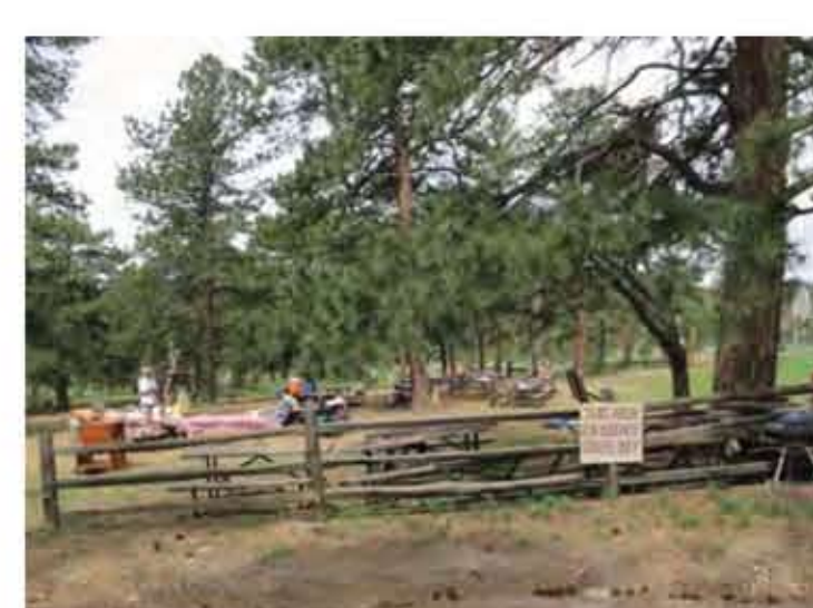
9. CAMPGROUND DAY USE AREA