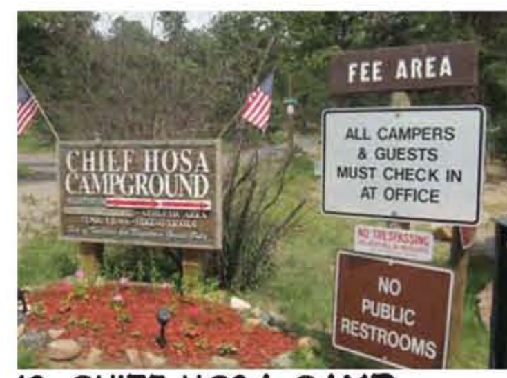
12. CHIEF HOSA CAMPGROUND ENTRY SIGN