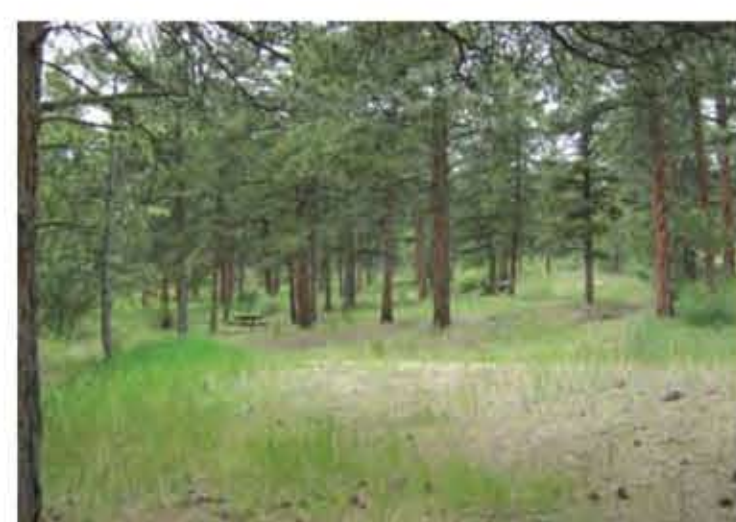
14. EXISTING CAMPGROUND SPUR