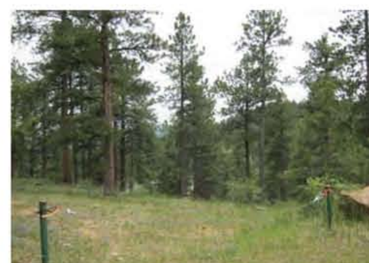
23. EXISTING GATE