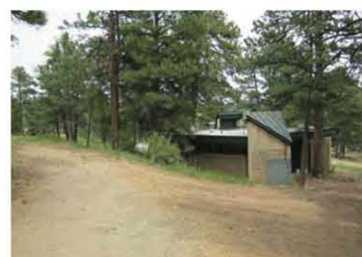
16. EXISTING RESTROOM/ SHOWER BUILDING AT ENTRY