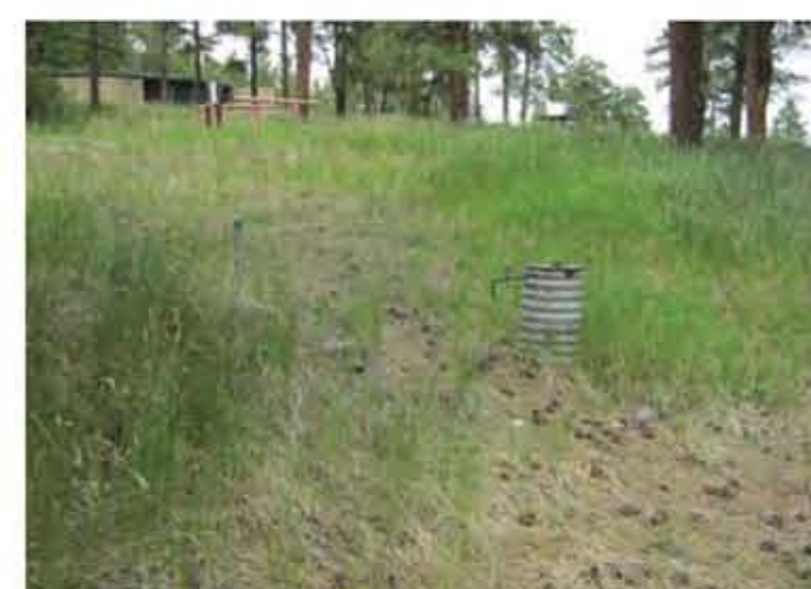
12. EXISTING UTILITIES