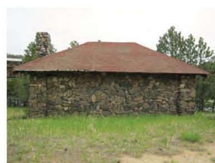
6. HISTORIC SHELTER