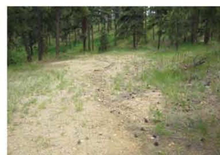
13. EXISTING CAMPGROUND SPUR