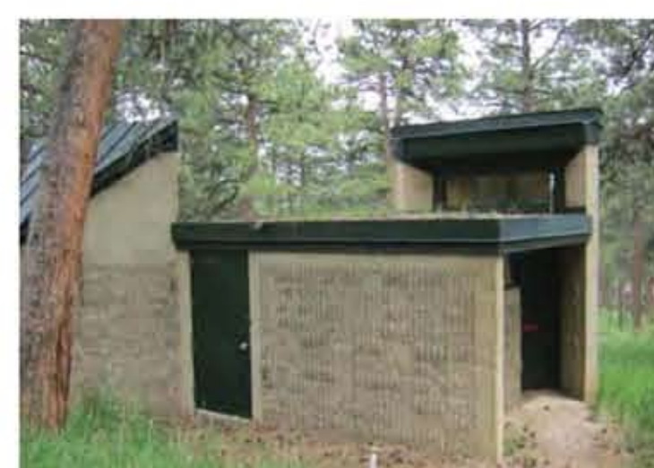
17. EXISTING RESTROOM