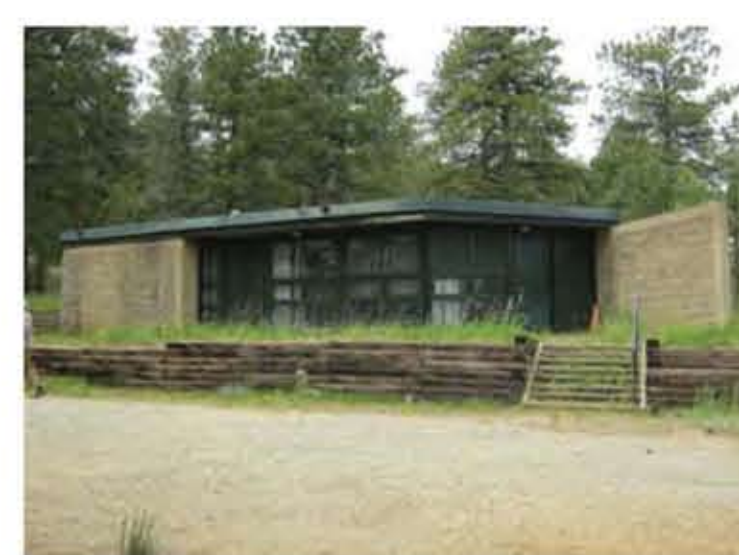
1. EXISTING CAMPGROUND BUILDING