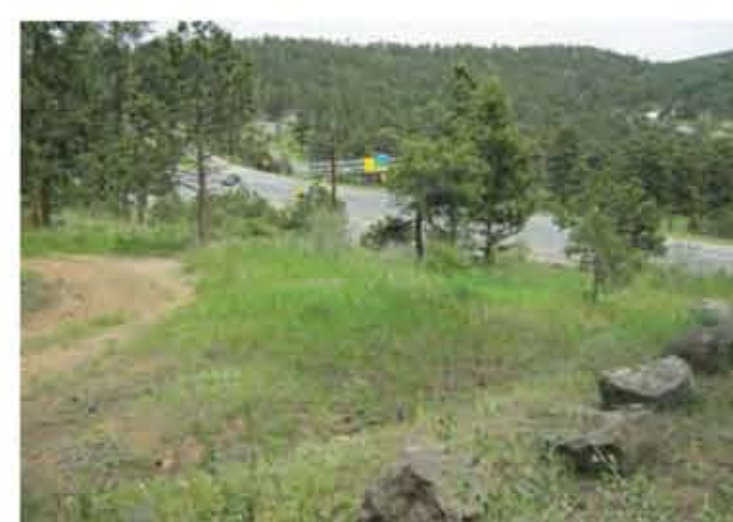
18. CAMPGROUND LOOP ROAD LOOKING SOUTHEAST