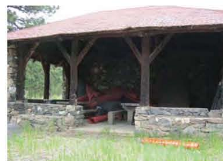
7. NORTH SIDE OF EXISTING SHELTER