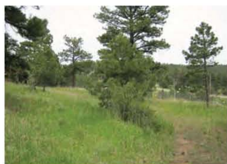
9. CAMPGROUND LOOP ROAD LOOKING EAST