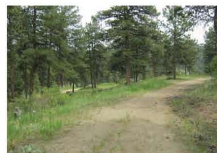
19. CAMPGROUND LOOP ROAD