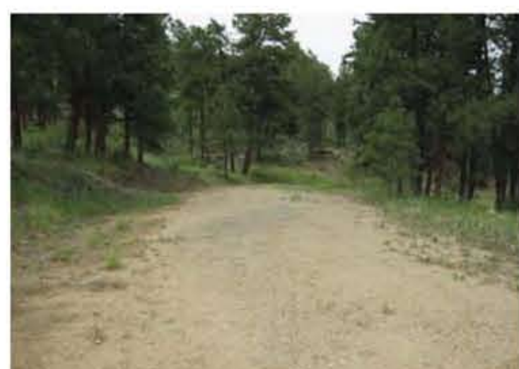
21. GROUP SITE