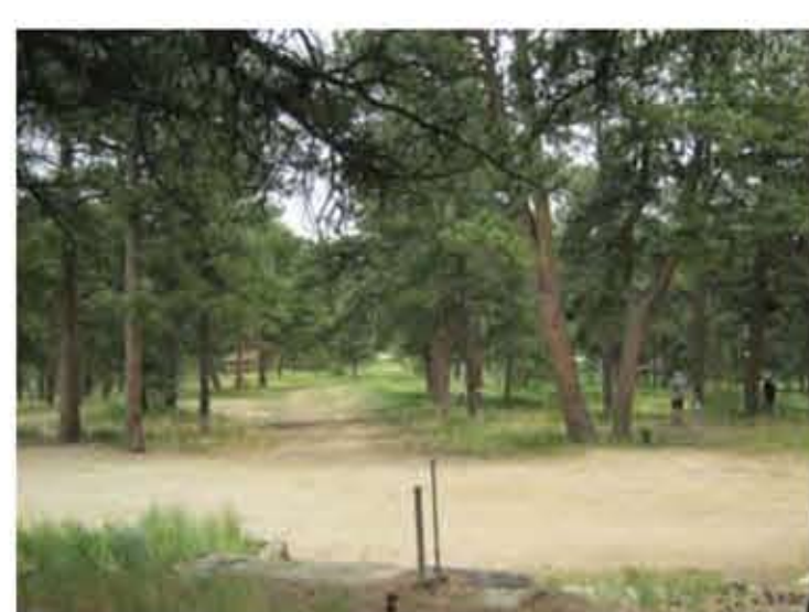
3. CAMPGROUND LOOP ROAD LOOKING SOUTH