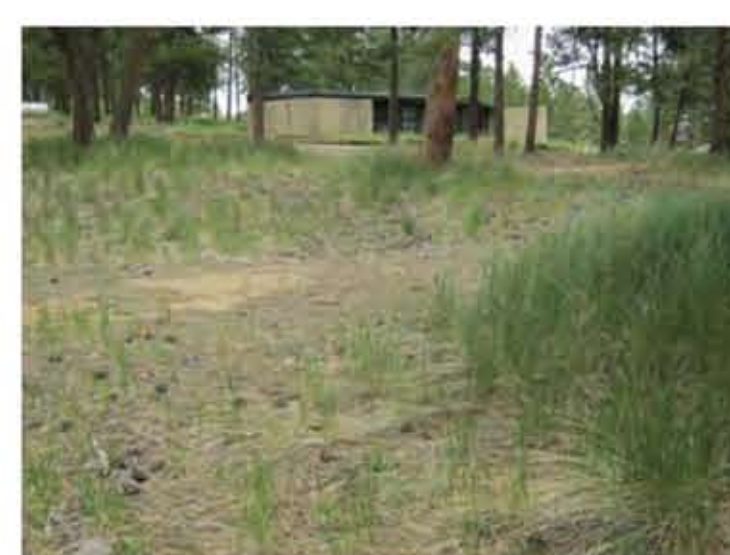
5. CAMPGROUND LOOP ROAD LOOKING TOWARDS ENTRY