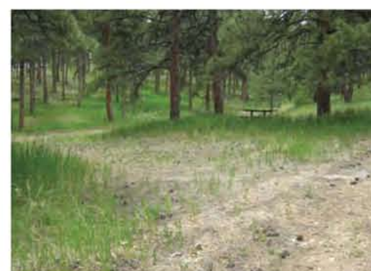
11. TYPICAL CAMPGROUND SPUR