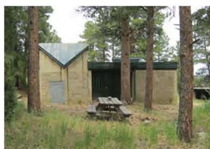
15. EXISTING RESTROOM