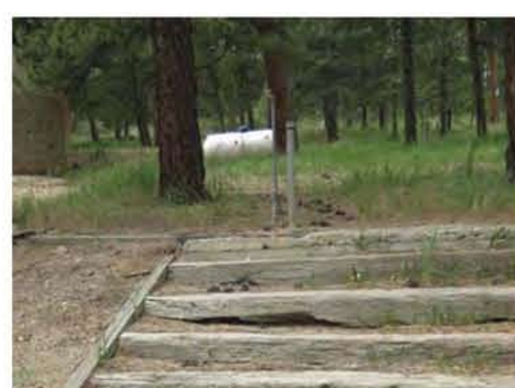
2. YARD HYDRANT