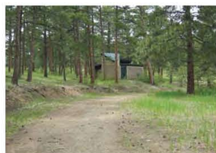
20. CAMPGROUND LOOP ROAD AND RESTROOM