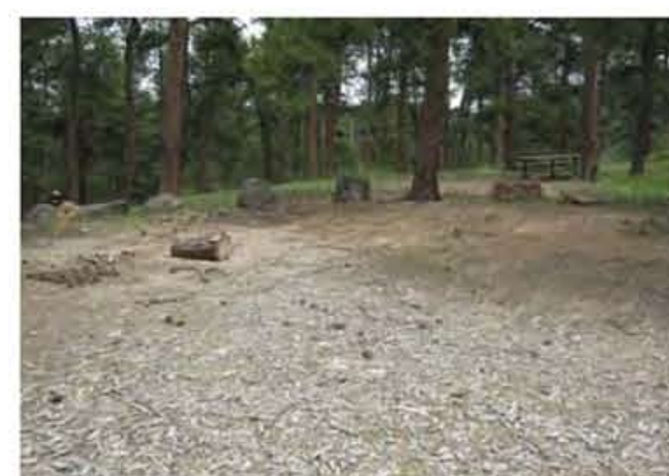
22. CAMP SPURS AT TURNAROUND