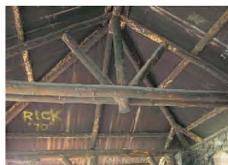
8. INTERIOR VIEW OF EXISTING SHELTER