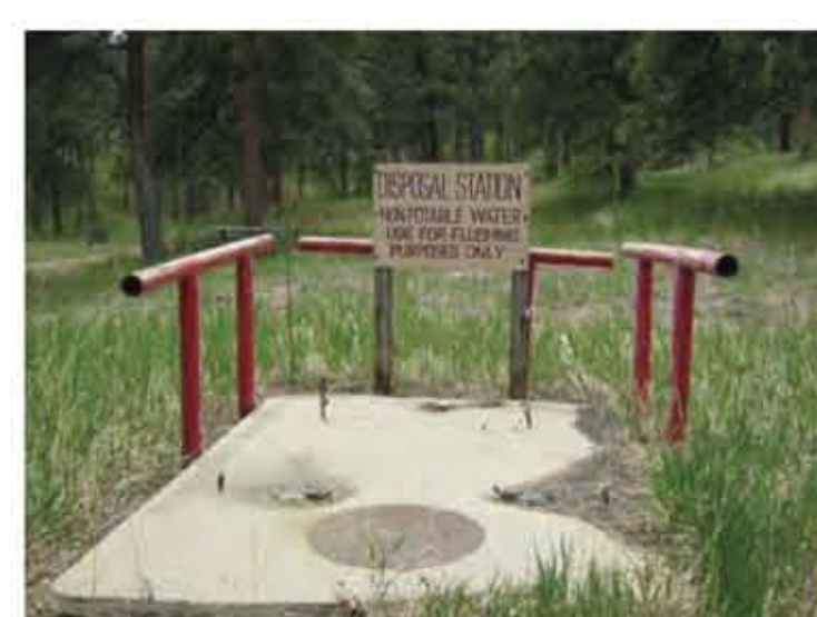
4. EXISTING DUMP STATION