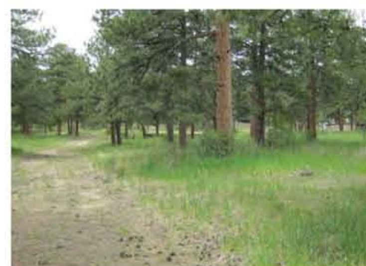
10. CAMPGROUND LOOP ROAD