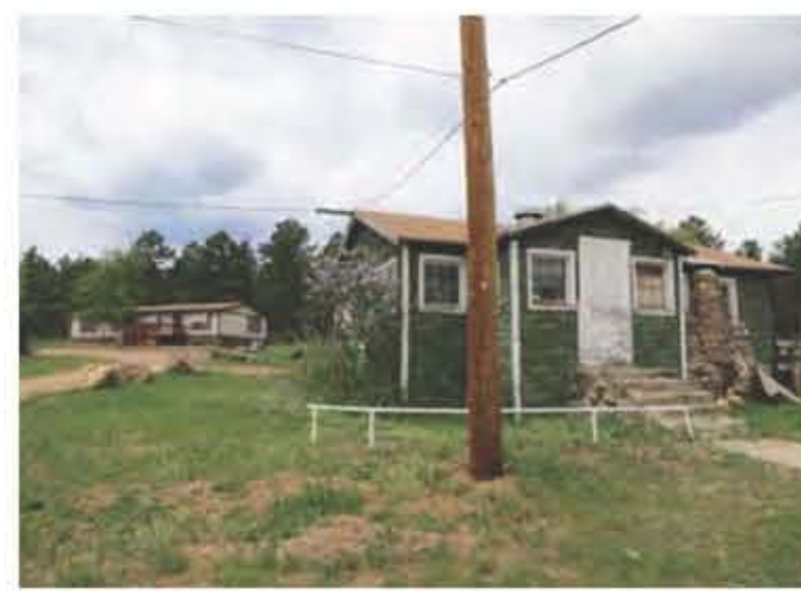
8. WOOD SHOP LOOKING NORTH