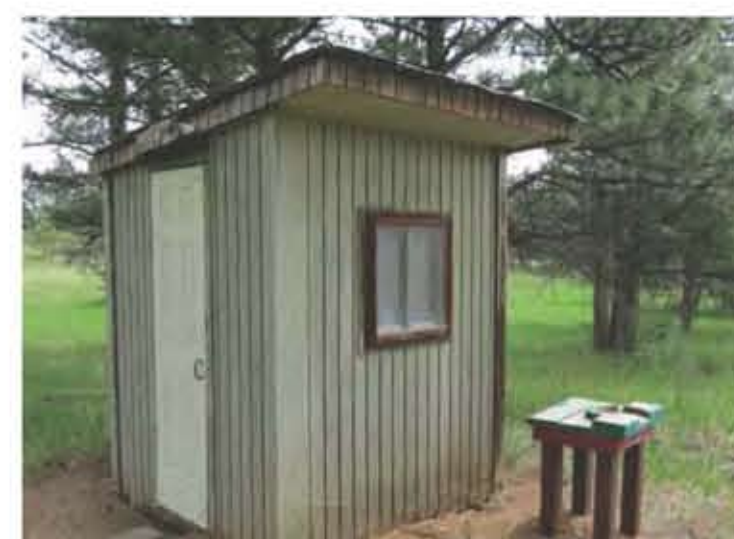
22. VAULT TOILET