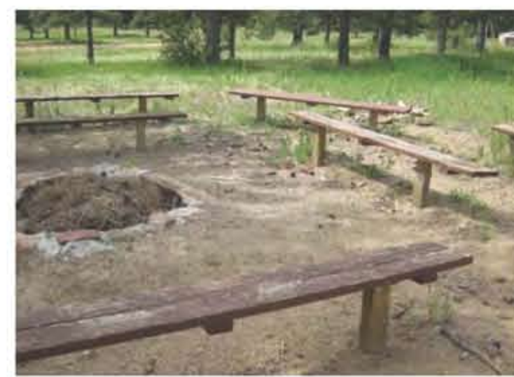
10. GROUP FIRE RING OUTSIDE BUNKHOUSE