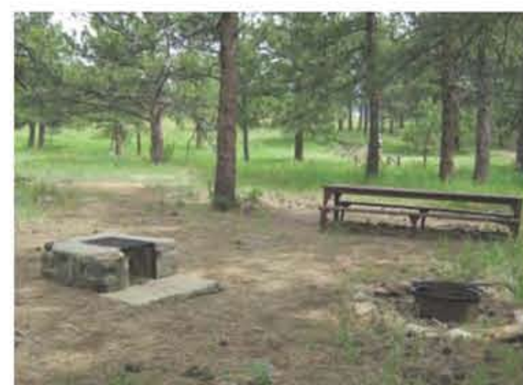
21. TYPICAL CAMPSITE