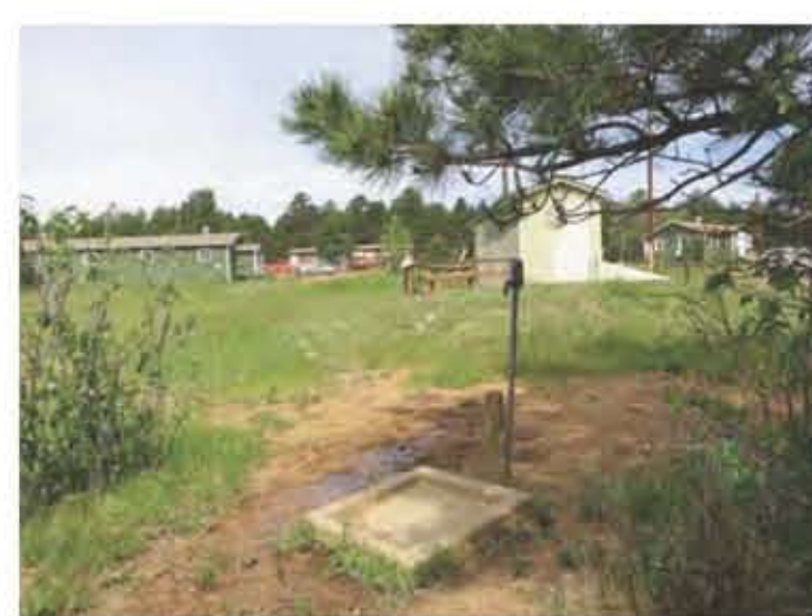
2. YARD HYDRANT