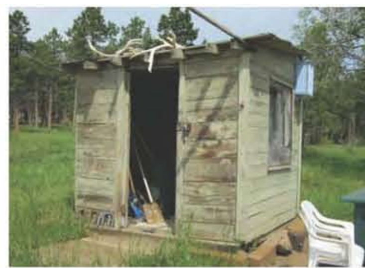
7. EXISTING STORAGE SHED