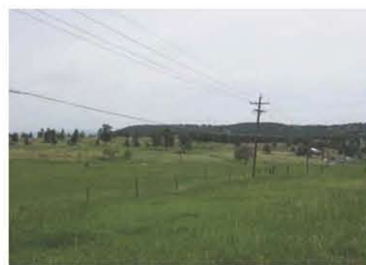
14. VIEW LOOKING NORTH ALONG PROPERTY BOUNDARY