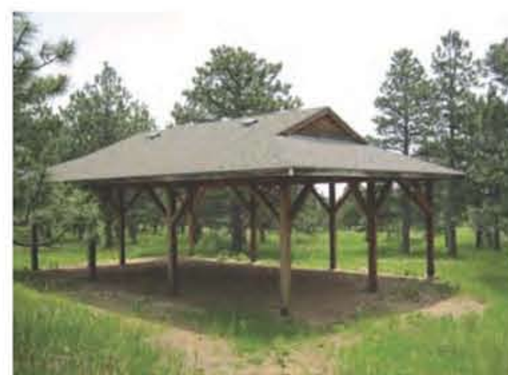
20. EXISTING SHELTER