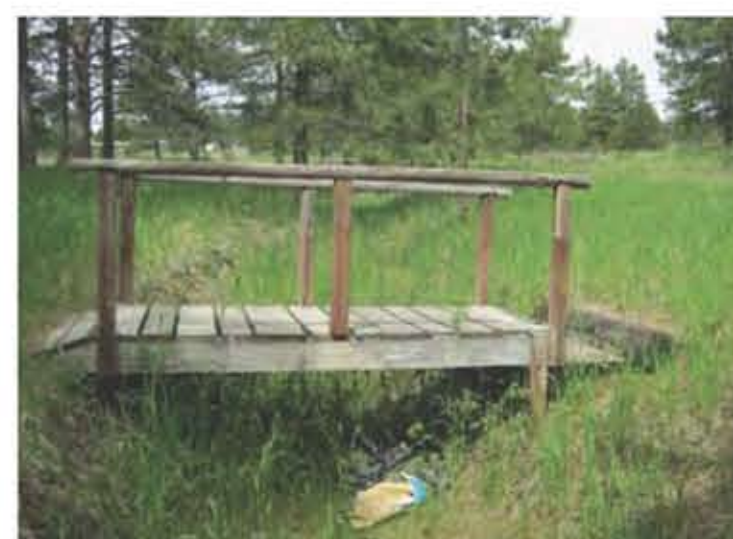
19. PEDESTRIAN BRIDGE OVER DRAINAGE