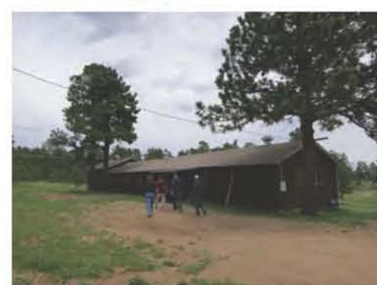
6. BUNKHOUSE LOOKING NORTH