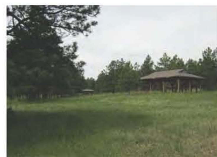
16. VIEW OF SHELTERS LOOKING WEST