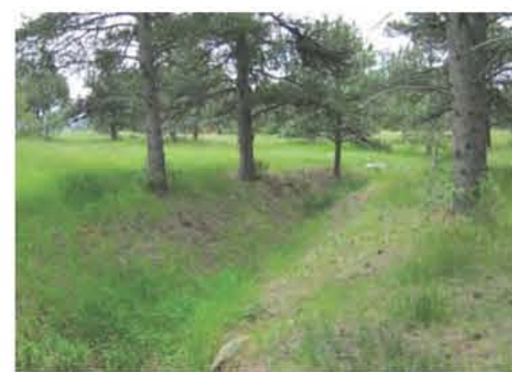
17. DRAINAGE THROUGH CAMPGROUND