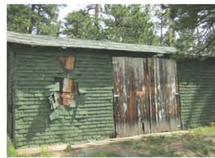
12. EXISTING BARN