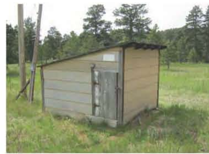
11. WELL HOUSE