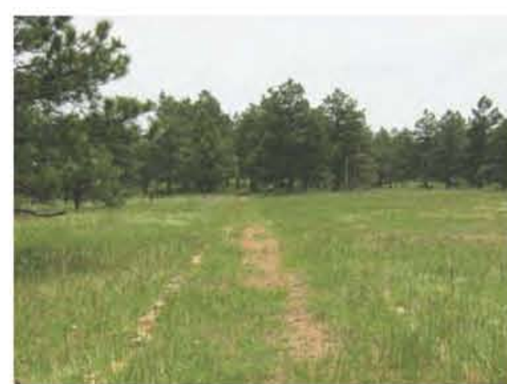
3. STONE LINED PATH LEADING TO CAMPING AREA