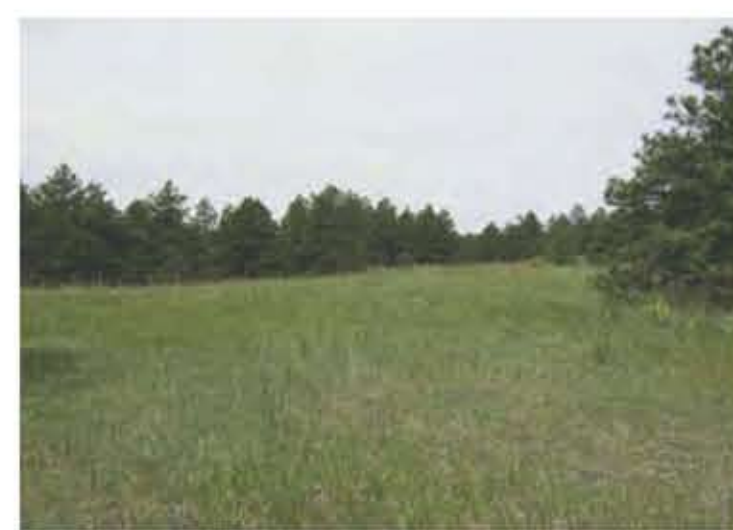
15. VIEW OF MEADOW LOOKING NORTHWEST