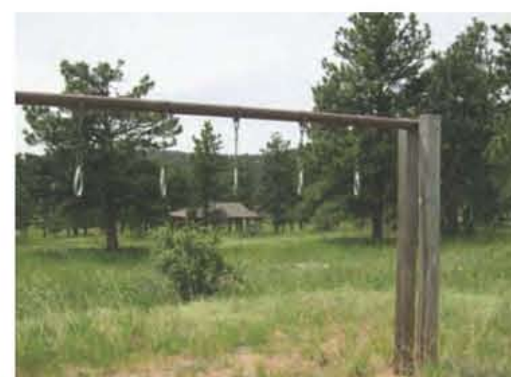
23. EXISTING PLAY EQUIPMENT