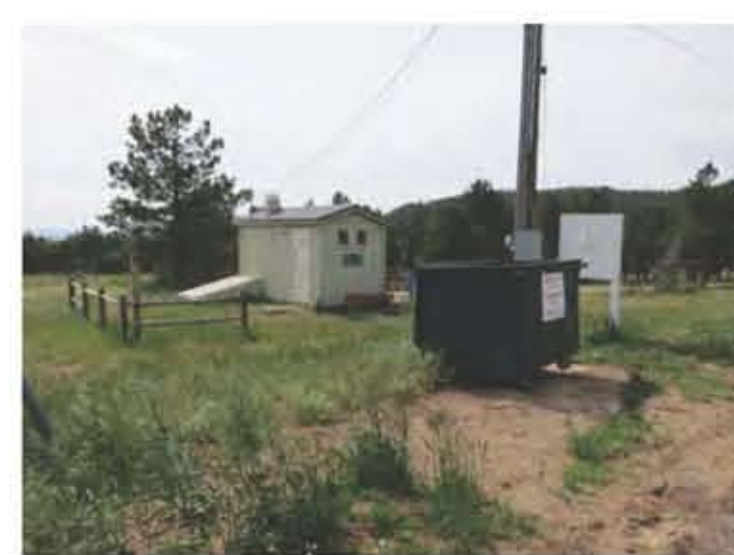
4. EXISTING VAULT TOILET, TRANSFORMER, + DUMPSTER LOOKING SOUTH