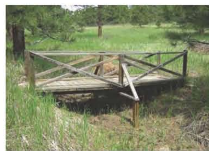
18. PEDESTRIAN BRIDGE OVER DRAINAGE