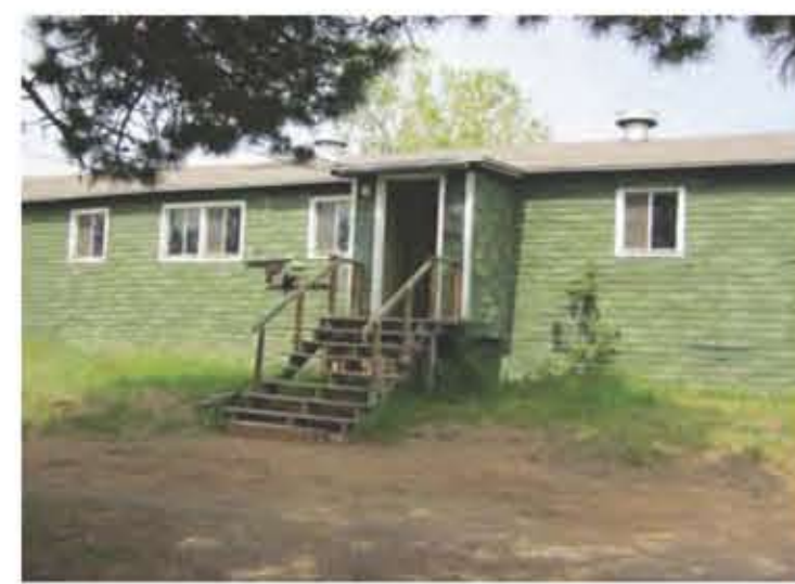
9. EXISTING BUNKHOUSE