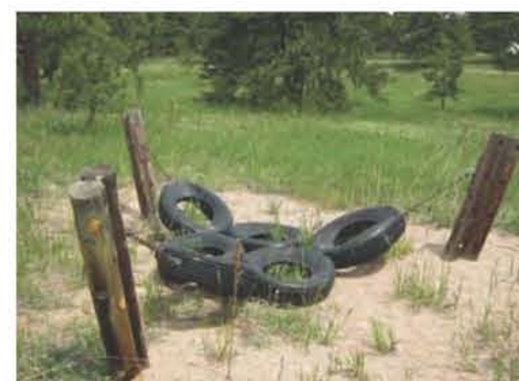
24. EXISTING PLAY EQUIPMENT