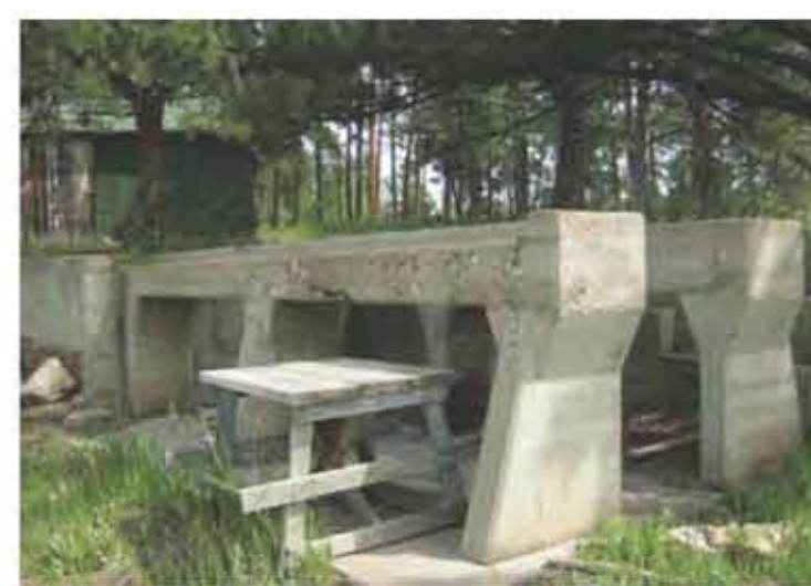
13. EXISTING CONCRETE VEHICLE RAMP NEAR BARN