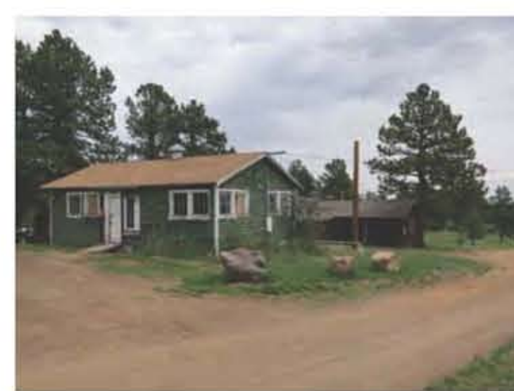
5. WOOD SHOP LOOKING EAST