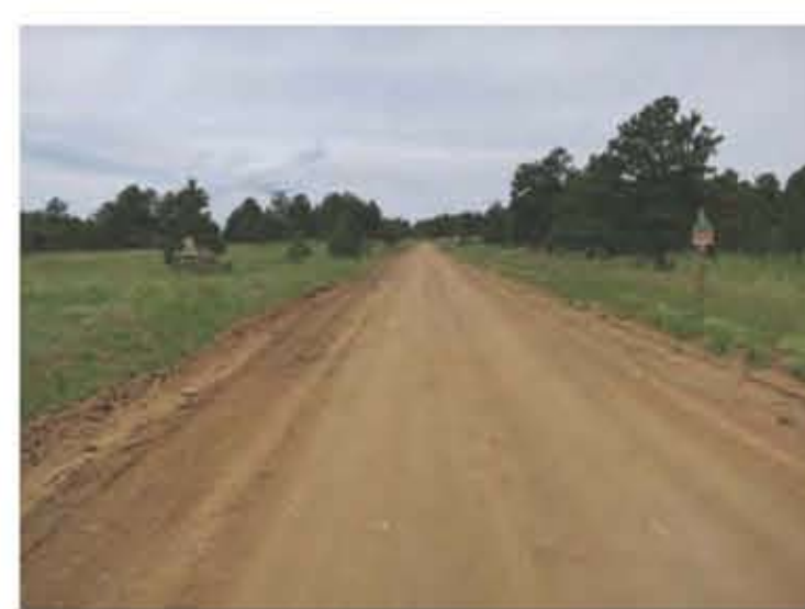
1. ENTRY ROAD LOOKING WEST