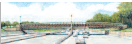
Illustration of pedestrian bridge over U.S. 6.

Beginning in 2014, the Colorado Department of Transportation (CDOT), the Federal Highway Administration and the City and County of Denver will replace six bridges over 6th Avenue from Knox Court to the BNSF rail yards.