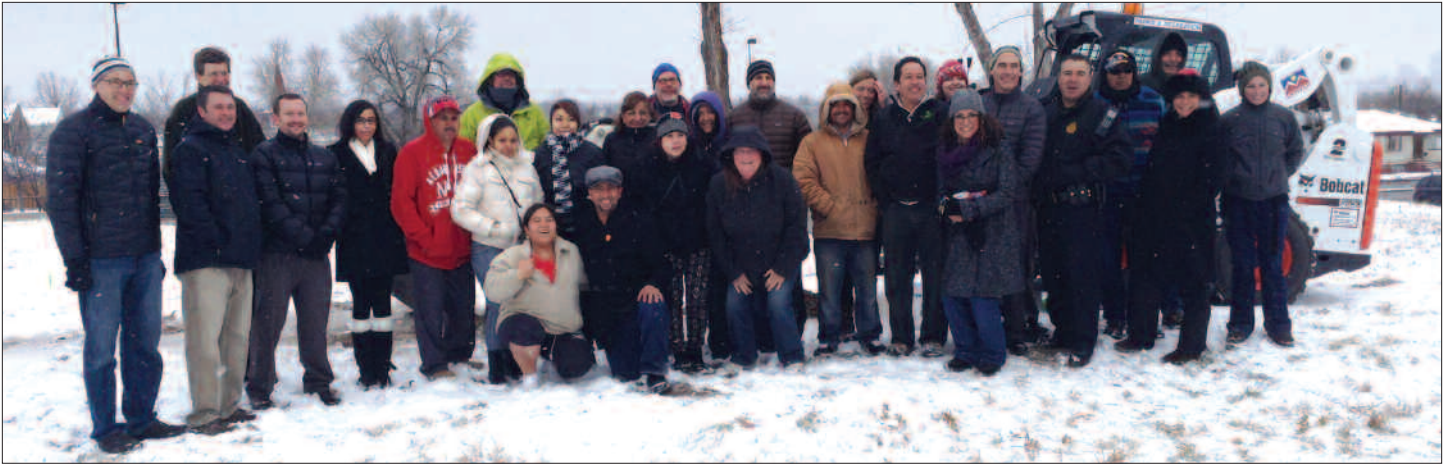
Community members and stakeholders celebrate the ground breaking of their new park.