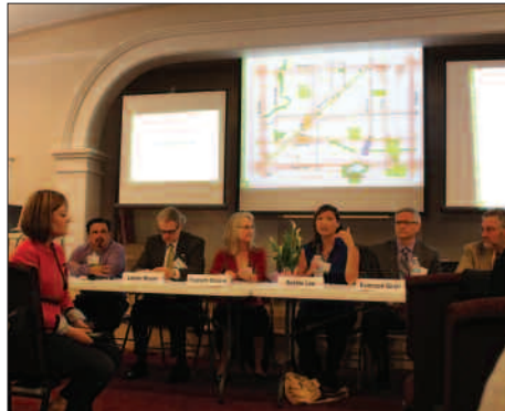
Urban Land Institute panel presents their recommendations for Westwood.