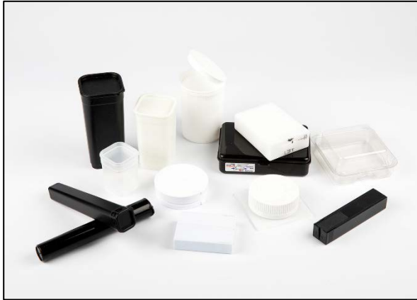
#5 Polypropylene and #2 HDPE Containers Recycle

Keeping recyclable waste out of the landfill is one important way to protect the environment. Cannabis products come in many types of packaging, and it's not always clear if they can be recycled. Here's how to recycle cannabis packaging in Denver – keep in mind that other cities and states may have different recycling rules. Always make sure your packaging is clean before recycling!