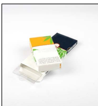
Coated Slide Boxes with Plastic Insert Trash