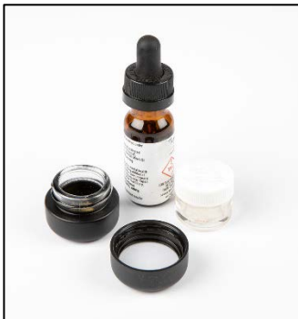
Glass Bottles with Plastic Caps Trash caps and Recycle glass