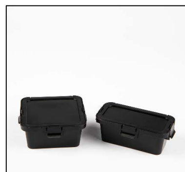
#5 Polypropylene made with prodegradant Recycle

Questions? Contact cannabissustainability@denvergov.org , or visit denvergov.org/cannabissustainability