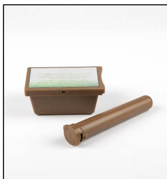
#7 Hemp Plastic Trash