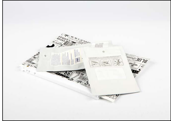
Mylar Bags Reuse then Trash