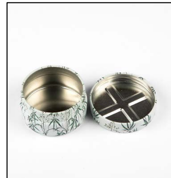
Aluminum Can Recycle