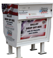
24-hour Ballot Drop Box