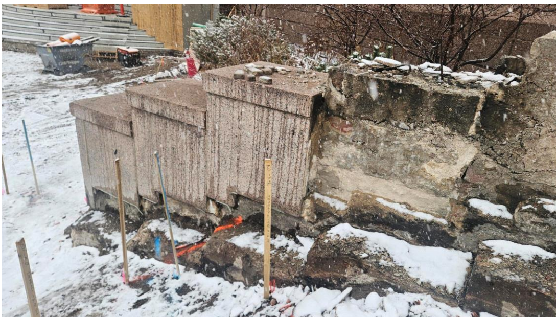
Figure 2: Detail View of Wall in Question: Spray paint markings indicate the location of the proposed footer.