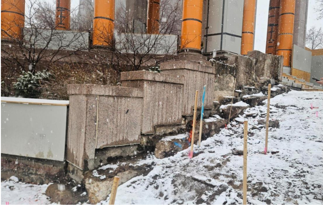
Figure 1: Portion of Planter Wall in Question: The upper half of the granite has been removed, as previously approved for demolition by the LPC. The lower half of the wall remains intact.

these remaining steps. The project team is seeking to demolish the remaining three stepped sections of the planter wall on each side of the Greek Theater to allow for the ADA-compliant slope pathway and the ramp footer. The removed granite cladding will be retained on site and buried adjacent to the remaining footing as a means of protecting the material for possible future restoration needs. A portion of the existing concrete backing wall will remain in place. All other portions of the concrete wall will be demolished.