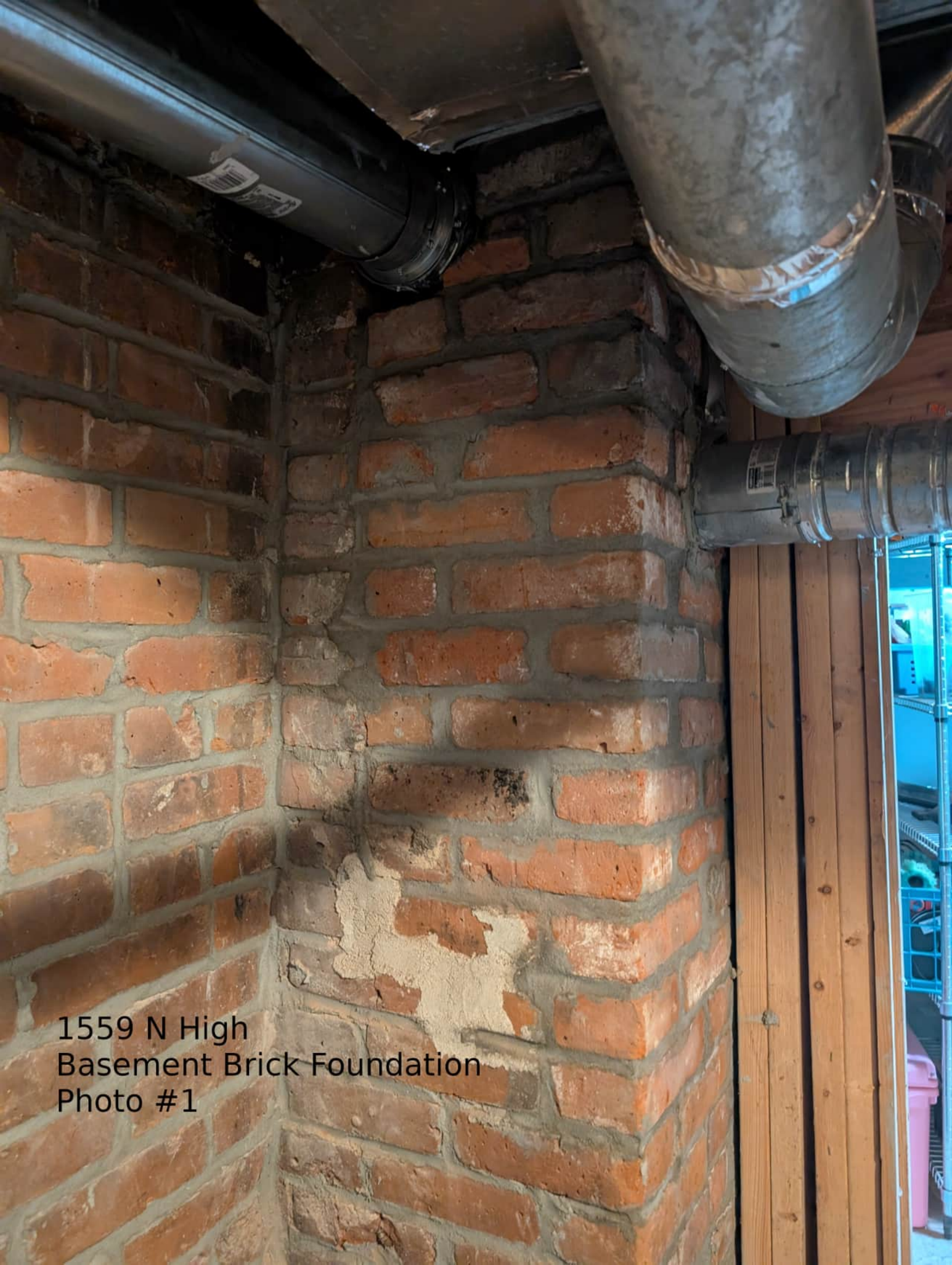
1559 N High Basement Brick Foundation Photo #1