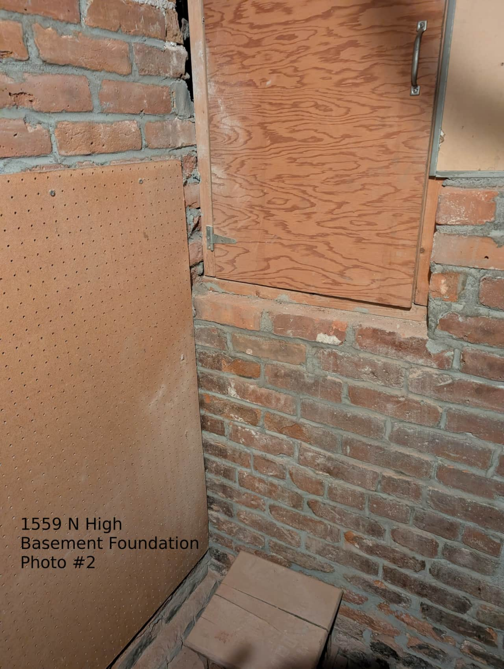
1559 N High Basement Foundation Photo #2