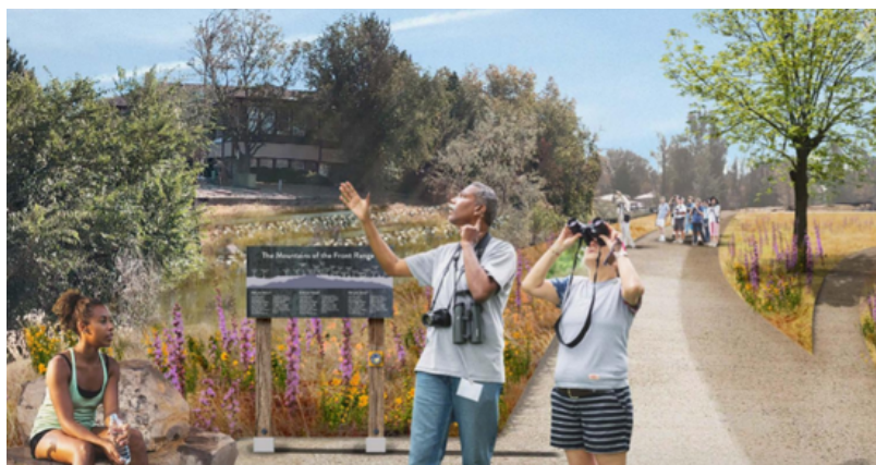
Visualization of future improvements