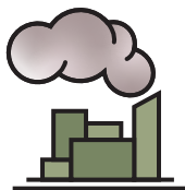
Sources of air pollution