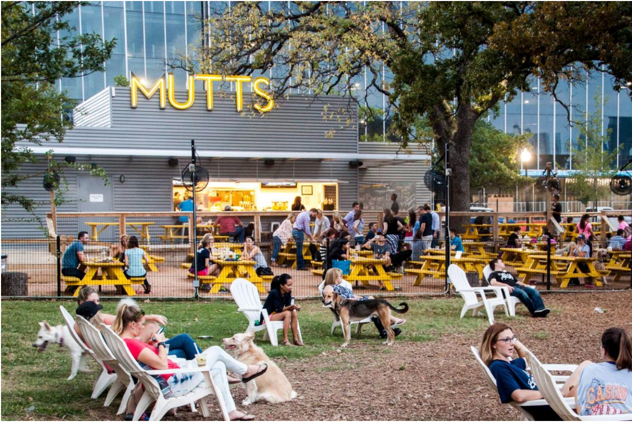
Mutts Canine Cantina, Dallas, TX