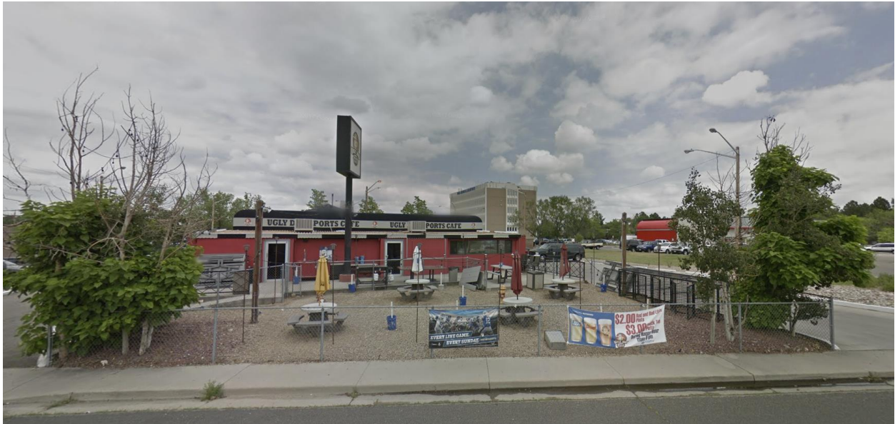
Ugly Dog Sports Café, 1345 Cortez Street, Denver CO 80221 (Unincorporated Adams County)