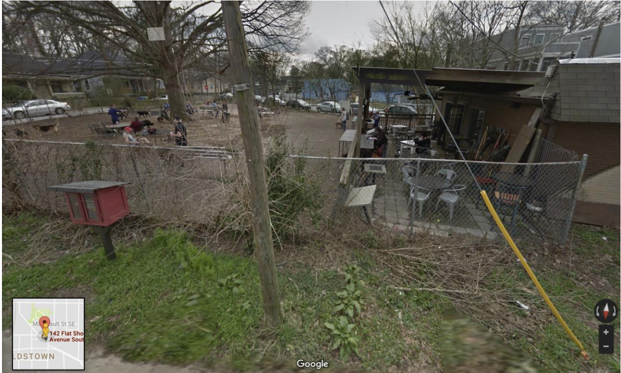
ParkGrounds – dog-friendly coffee, food, and drinks spot. Atlanta, GA