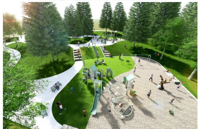
Southmoor Park Playground Rendering